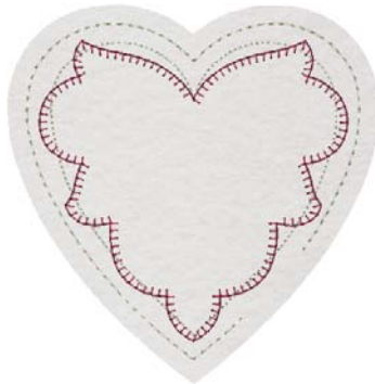
12376-01B Cutwork Heart B 4.62 X 4.70 in. 117.35 X 119.38 mm 1,690 St.