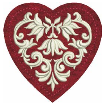
12376-07 Satins Heart 4.37 X 4.44 in. 111.00 X 112.78 mm 10,127 St.

⌘ Design contains a loose fill. ⚙ Some white areas shown are not stitched.