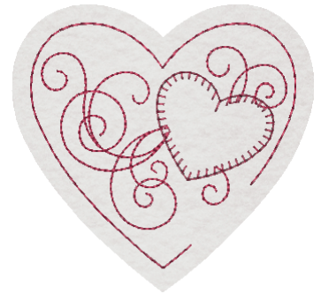
12376-02B Heart in Heart B 3.83 X 3.63 in. 97.28 X 92.20 mm 1,764 St.