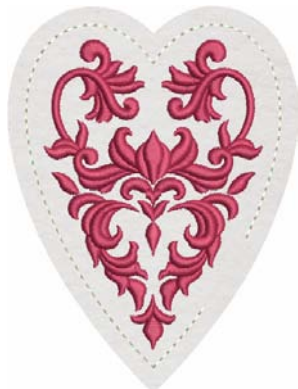
12376-05 Long Satins Heart 3.87 X 5.13 in. 98.30 X 130.30 mm 8,687 St. L