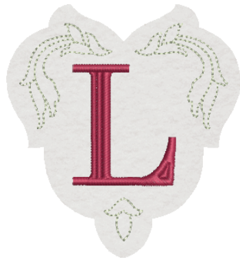
12376-11A L Heart A 3.43 X 3.69 in. 87.12 X 93.73 mm 2,806 St.