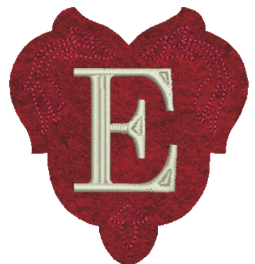
12376-14A E Heart A 3.43 X 3.69 in. 87.12 X 93.73 mm 3,478 St.

☞ Design contains a loose fill. ⚙ Some white areas shown are not stitched.