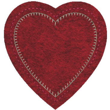
12376-09B Swirls Heart 1 Part B 3.66 X 3.85 in. 92.96 X 97.79 mm 833 St.