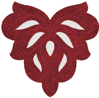
12376-01A Cutwork Heart A 3.82 X 3.71 in. 97.03 X 94.23 mm 1,844 St.

Note: Some designs in this collection may have been created using unique special stitches and/or techniques. To preserve design integrity when rescaling or rotating designs in your software, always rescale or rotate designs using the handles directly on-screen.