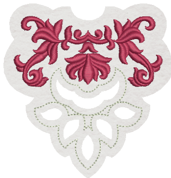
12376-06A Satins & Cutwork Heart A 3.92 X 4.05 in. 99.57 X 102.87 mm 7,147 St.