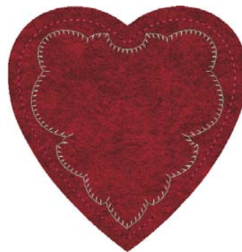
12376-06B Satins & Cutwork Heart B 4.93 X 5.03 in. 125.22 X 127.76 mm 1,178 St. L