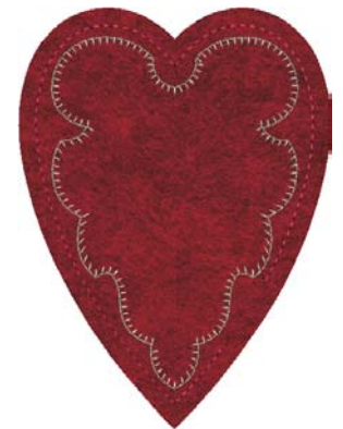
12376-04B Long Satins & Cutwork Heart B 4.31 X 5.78 in. 109.47 X 146.81 mm 1,298 St. L