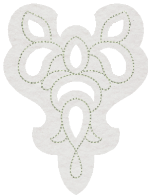
12376-03A Long Cutwork Heart A 3.20 X 4.20 in. 81.28 X 106.68 mm 1,776 St.