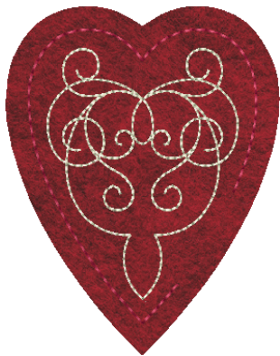
12376-10 Swirls Heart 2 2.92 X 3.71 in. 74.17 X 94.23 mm 1,563 St.