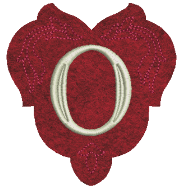
12376-12A O Heart A 3.43 X 3.69 in. 87.12 X 93.73 mm 3,180 St.