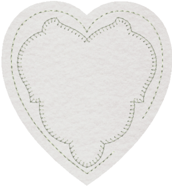
12376-14B E Heart B 4.24 X 4.56 in. 107.70 X 115.82 mm 1,033 St.

Note: Some designs in this collection may have been created using unique special stitches and/or techniques. To preserve design integrity when rescaling or rotating designs in your software, always rescale or rotate designs using the handles directly on-screen.