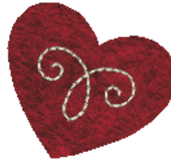
12376-02A Heart in Heart A 1.46 X 1.35 in. 37.08 X 34.29 mm 297 St. S