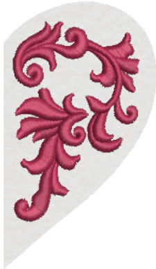
12376-08A Split Heart A 2.05 X 3.57 in. 52.07 X 90.68 mm 3,663 St.

Note: Some designs in this collection may have been created using unique special stitches and/or techniques. To preserve design integrity when rescaling or rotating designs in your software, always rescale or rotate designs using the handles directly on-screen.