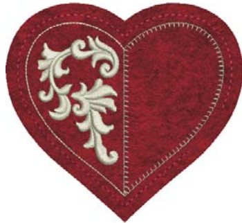
12376-08B Split Heart B 4.93 X 4.52 in. 125.22 X 114.81 mm 4,616 St.