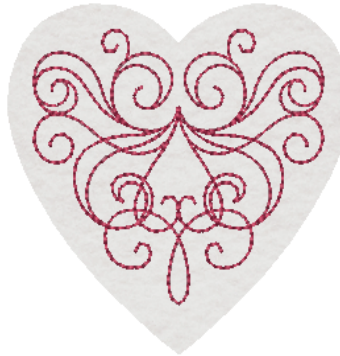
12376-09A Swirls Heart 1 Part A 2.91 X 2.98 in. 73.91 X 75.69 mm 2,294 St.