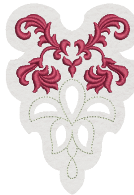
12376-04A Long Satins & Cutwork Heart A 3.36 X 4.81 in. 85.34 X 122.17 mm 5,744 St.