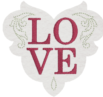
12376-15A LOVE Heart A 3.71 X 3.47 in. 94.23 X 88.14 mm 4,558 St.