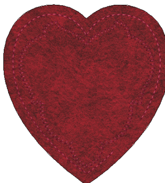
12376-13B V Heart B 4.24 X 4.56 in. 107.70 X 115.82 mm 1,033 St.