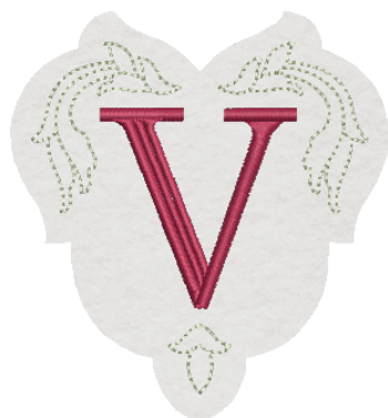
12376-13A V Heart A 3.43 X 3.69 in. 87.12 X 93.73 mm 2,887 St.