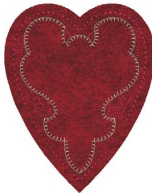
12376-03B Long Cutwork Heart B 4.08 X 5.12 in. 103.63 X 130.05 mm 1,738 St. L