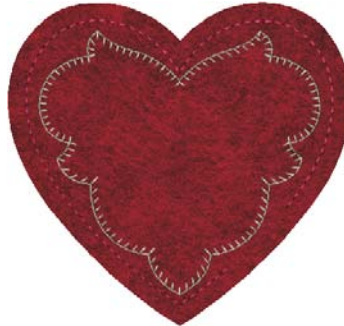
12376-15B LOVE Heart B 4.55 X 4.28 in. 115.57 X 108.71 mm 1,064 St.

⌘ Design contains a loose fill. ⚙ Some white areas shown are not stitched.