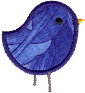
12386-01 Birdie 1 Appliqué 1.79 X 1.91 in. 45.47 X 48.51 mm 1,156 St.

Note: Some designs in this collection may have been created using unique special stitches and/or techniques. To preserve design integrity when rescaling or rotating designs in your software, always rescale or rotate designs using the handles directly on-screen.