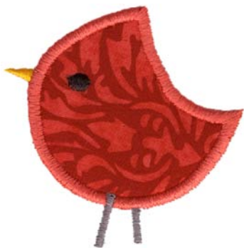
12386-05 Birdie 2 Appliqué 2.13 X 2.19 in. 54.10 X 55.63 mm 1,574 St.