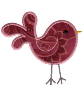
12386-08 Fancy Birdie Appliqué 3.56 X 3.24 in. 90.42 X 82.30 mm 3,325 St.