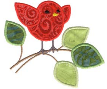
12386-04 Birdie on Branch Appliqué 4.16 X 3.65 in. 105.66 X 92.71 mm 6,409 St. ⚙