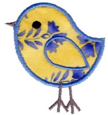
12386-07 Birdie 3 Appliqué 2.30 X 2.57 in. 58.42 X 65.28 mm 2,176 St. ⚙