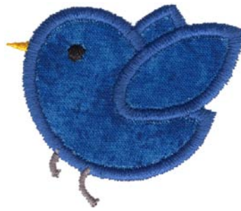
12386-02 Flying Birdie Appliqué 2.11 X 1.82 in. 53.59 X 46.23 mm 1,988 St.