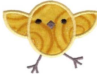
12386-03 Bounding Birdie Appliqué 2.77 X 2.10 in. 70.36 X 53.34 mm 2,527 St.