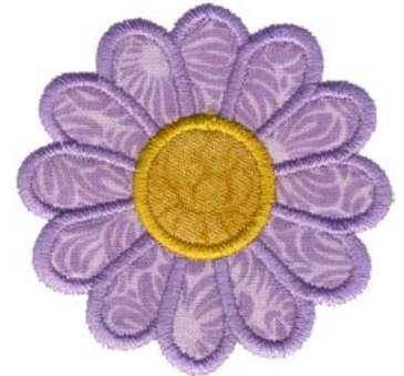
12390-04 Daisy Appliqué 2.41 X 2.40 in. 61.21 X 60.96 mm 3,548 St.