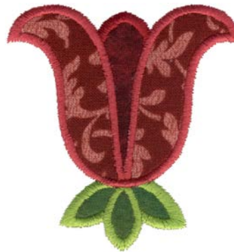
12390-03 Red Tulip Appliqué 2.73 X 2.92 in. 69.34 X 74.17 mm 3,297 St.