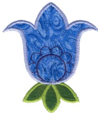
12390-06 Blue Tulip Appliqué 2.79 X 3.28 in. 70.87 X 83.31 mm 3,241 St.