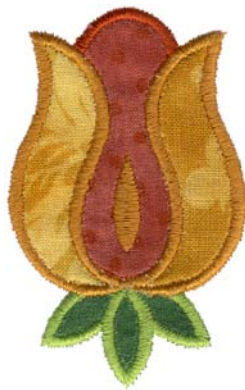
12390-02 Golden Tulip Appliqué 1.80 X 2.91 in. 45.72 X 73.91 mm 3,215 St.