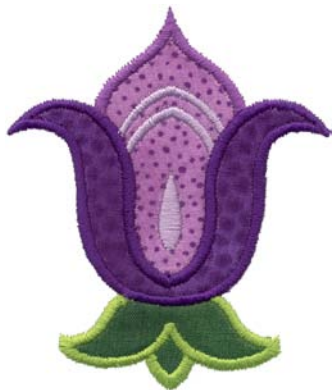
12390-01 Purple Tulip Appliqué 2.76 X 3.33 in. 70.10 X 84.58 mm 3,961 St.

Note: Some designs in this collection may have been created using unique special stitches and/or techniques. To preserve design integrity when rescaling or rotating designs in your software, always rescale or rotate designs using the handles directly on-screen.