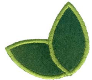
12390-08 Leaves Appliqué 2.00 X 1.89 in. 50.80 X 48.01 mm 1,265 St.

⌘ Design contains a loose fill. ⚙ Some white areas shown are not stitched.