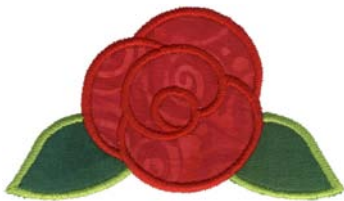
12390-05 Rose Appliqué 3.82 X 2.19 in. 97.03 X 55.63 mm 3,248 St.