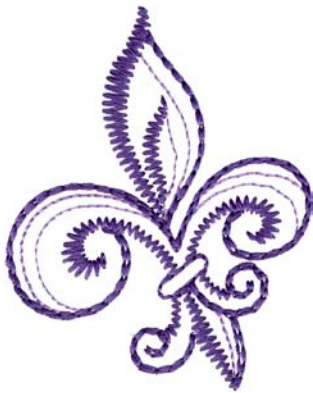
12393-01 Fleur-de-Lis 2.21 X 2.84 in. 56.13 X 72.14 mm 2,240 St. ⚙️

Note: Some designs in this collection may have been created using unique special stitches and/or techniques. To preserve design integrity when rescaling or rotating designs in your software, always rescale or rotate designs using the handles directly on-screen.