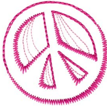
12393-02 Peace 2.54 X 2.55 in. 64.52 X 64.77 mm 2,378 St. ⚙️