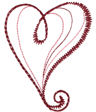
12393-04 Heart 2.23 X 2.85 in. 56.64 X 72.39 mm 1,579 St. ⚙️