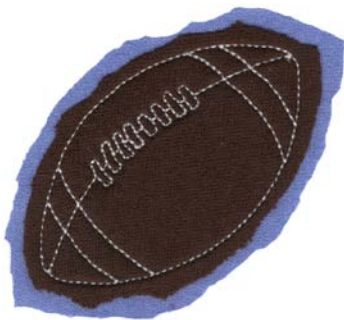
12420-13 Football 2.44 X 2.27 in. 61.98 X 57.66 mm 1,104 St.

Note: Some designs in this collection may have been created using unique special stitches and/or techniques. To preserve design integrity when rescaling or rotating designs in your software, always rescale or rotate designs using the handles directly on-screen.