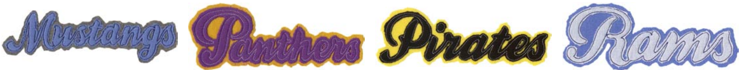
12420-05 Mustangs 1.95 X 6.88 in. 49.53 X 174.75 mm 2,076 St. L