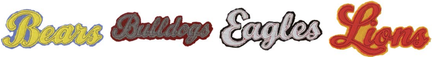
12420-01 Bears 2.25 X 6.38 in. 57.15 X 162.05 mm 1,933 St. L

Note: Some designs in this collection may have been created using unique special stitches and/or techniques. To preserve design integrity when rescaling or rotating designs in your software, always rescale or rotate designs using the handles directly on-screen.