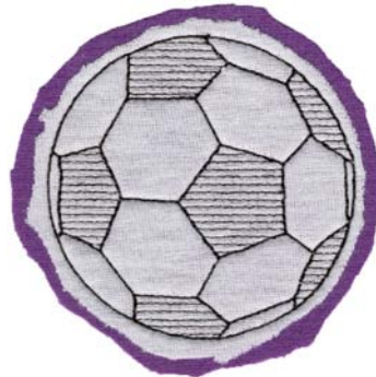
12420-14 Soccer 2.42 X 2.42 in. 61.47 X 61.47 mm 1,746 St.

Listings below indicate color sample, stitching order and suggested thread color number. Most numbers indicate Isacord thread. However, colors beginning with 20501 refer to YLI Fine Metallics, 7 refer to Yenmet Metallic, 8 refer to YLI Variations Variegated Thread and 9 refer to Isacord Multicolor Variegated.