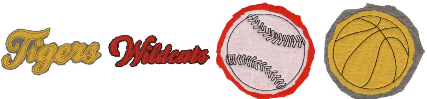
12420-09 Tigers 3.09 X 6.86 in. 78.49 X 174.24 mm 2,266 St. L