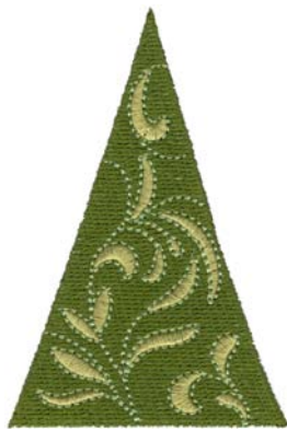
12433-02 Tree 2 2.39 X 3.58 in. 57.91 X 91.95 mm 6,986 St.