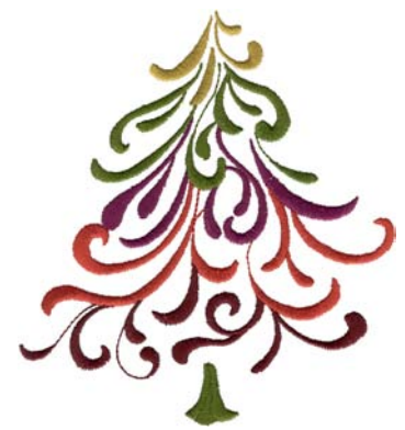
12433-08 Tree 8 4.51 X 5.05 in. 114.55 X 128.27 mm 8,169 St.