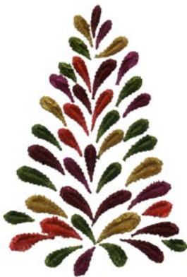
12433-05 Tree 5 3.28 X 4.90 in. 83.31 X 124.46 mm 15,602 St.