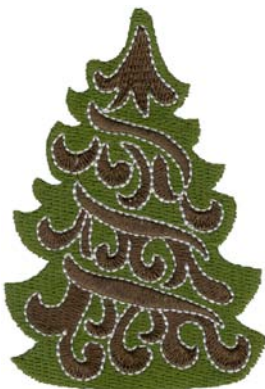
12433-09 Tree 9 2.58 X 3.72 in. 65.53 X 94.49 mm 16,178 St.