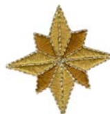
12433-11 Star 2 1.52 X 1.59 in. 38.61 X 40.39 mm 1,778 St.