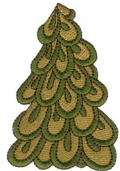
12433-04 Tree 4 2.35 X 3.55 in. 59.69 X 90.17 mm 12,587 St.