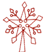
12433-13 Star 4 1.35 X 1.73 in. 34.29 X 43.94 mm 1,097 St.

Design contains a loose fill. Some white areas shown are not stitched.