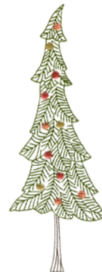
12433-07 Tree 7 Jumbo 2.75 X 7.75 in. 69.85 X 196.85 mm 4,848 St.