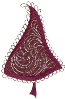
12433-01 Tree 1 3.09 X 4.72 in. 78.49 X 119.89 mm 8,923 St.

Note: Some designs in this collection may have been created using unique special stitches and/or techniques. To preserve design integrity when rescaling or rotating designs in your software, always rescale or rotate designs using the handles directly on-screen.