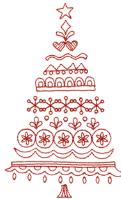
12433-03 Tree 3 2.98 X 4.90 in. 75.69 X 124.46 mm 5,451 St.