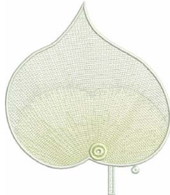
12454-03 FSL Lily 5.01 X 5.80 in. 127.25 X 147.32 mm 20,028 St. ⚡ ⚙ L

Note: Some designs in this collection may have been created using unique special stitches and/or techniques. To preserve design integrity when rescaling or rotating designs in your software, always rescale or rotate designs using the handles directly on-screen.