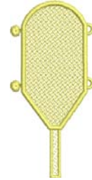
12454-04 FSL Lily Stamen 1.66 X 3.48 in. 42.16 X 88.39 mm 4,137 St. ⚡ ⚙

Listings below indicate color sample, stitching order and suggested thread color number. Most numbers indicate Isacord thread. Colors beginning with 20501 refer to YLI Fine Metallics, 7 refer to Yenmet Metallic, 8 refer to YLI Variations Variegated Thread and 9 refer to Isacord Multicolor Variegated.