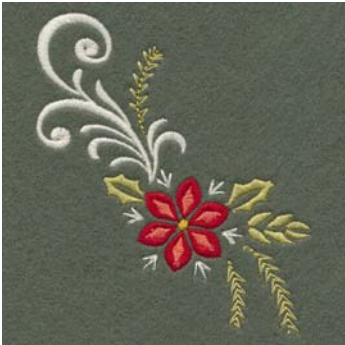
12470-24 Poinsettia 4 3.48 X 4.13 in. 88.39 X 104.90 mm 5,353 St. ⚙️

Note: Some designs in this collection may have been created using unique special stitches and/or techniques. To preserve design integrity when rescaling or rotating designs in your software, always rescale or rotate designs using the handles directly on-screen.