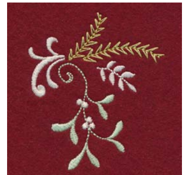
12470-31 Mistletoe 1 2.47 X 2.86 in. 62.74 X 72.64 mm 2,244 St. ⚙️