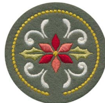
12470-11 Cupcake Decoration 2 2.51 X 2.51 in. 63.75 X 63.75 mm 3,385 St.