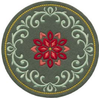
12470-01 Coaster 1 5.01 X 5.01 in. 127.25 X 127.25 mm 14,212 St. ❄️ L

Note: Some designs in this collection may have been created using unique special stitches and/or techniques. To preserve design integrity when rescaling or rotating designs in your software, always rescale or rotate designs using the handles directly on-screen.