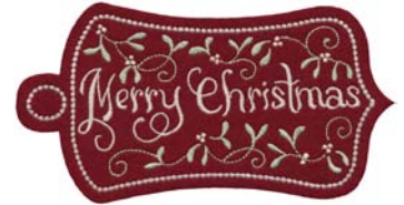
12470-04 Merry Christmas Tag 2 6.38 X 3.38 in. 162.05 X 85.85 mm 10,455 St. ❄️ L