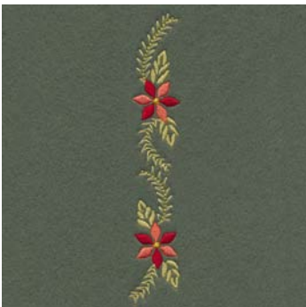
12470-28 Poinsettia Border 1.03 X 5.85 in. 26.16 X 148.59 mm 2,927 St. ⚙️ LS