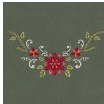
12470-21 Poinsettia 1 8.44 X 3.99 in. 214.38 X 101.35 mm 12,362 St. ❄️ L