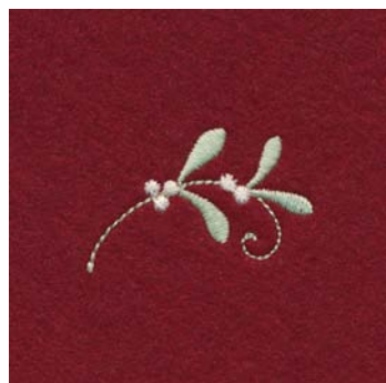
12470-33 Mistletoe 3 1.57 X 1.00 in. 39.88 X 25.40 mm 628 St. S