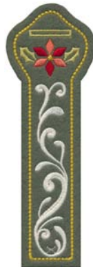
12470-17 Napkin Ring 1 2.25 X 6.67 in. 57.15 X 169.42 mm 7,094 St. ❄️ L