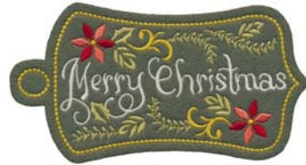
12470-03 Merry Christmas Tag 1 6.38 X 3.38 in. 162.05 X 85.85 mm 11,201 St. ❄️ L