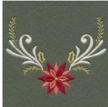
12470-25 Poinsettia 5 4.10 X 3.26 in. 104.14 X 82.80 mm 5,372 St. ⚙️