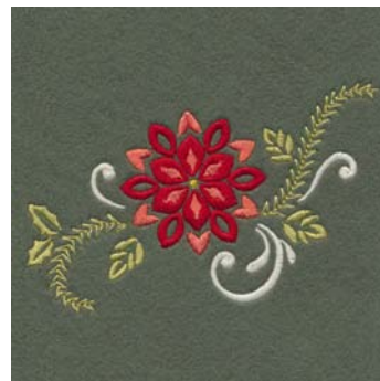
12470-22 Poinsettia 2 4.89 X 3.23 in. 124.21 X 82.04 mm 7,143 St. ❄️