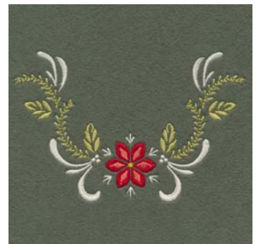
12470-23 Poinsettia 3 5.48 X 3.55 in. 139.19 X 90.17 mm 6,604 St. ❄️ L