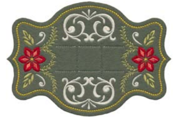
12470-19 Utensil Holder 1 7.39 X 5.12 in. 187.71 X 130.05 mm 17,899 St. ❄️ L