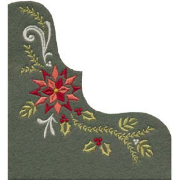
12470-16_A Menu Holder Pocket 4.86 X 5.38 in. 123.44 X 136.65 mm 6,265 St. ❄️ L