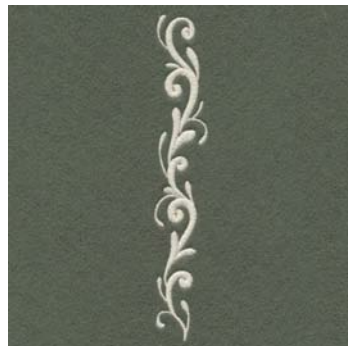
12470-29 Swirls Border .90 X 5.36 in. 22.86 X 136.14 mm 3,661 St. ⚙️ LS