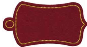
12470-07 Blank Tag 6.38 X 3.38 in. 162.05 X 85.85 mm 2,899 St. ❄️ L