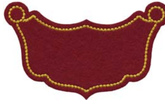
12470-15 Blank Wine Tag 4.59 X 2.72 in. 116.59 X 69.09 mm 2,345 St. ❄️