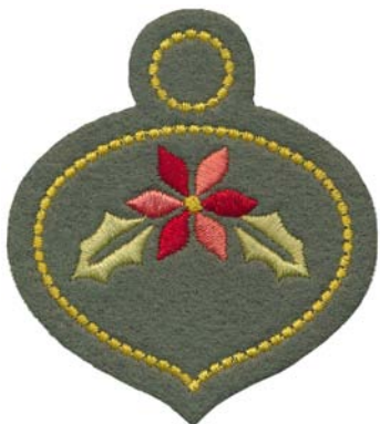
12470-09 Small Tag 2 2.68 X 3.04 in. 68.07 X 77.22 mm 2,604 St. ❄️