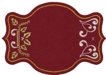
12470-20 Utensil Holder 2 7.40 X 5.11 in. 187.96 X 129.79 mm 8,443 St. ❄️ L