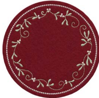
12470-02 Coaster 2 5.01 X 5.01 in. 127.25 X 127.25 mm 6,514 St. ❄️ L