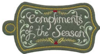
12470-06 Compliments Tag 6.39 X 3.39 in. 162.31 X 86.11 mm 11,948 St. ❄️ L