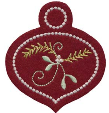
12470-08 Small Tag 1 2.68 X 3.04 in. 68.07 X 77.22 mm 2,307 St. ❄️