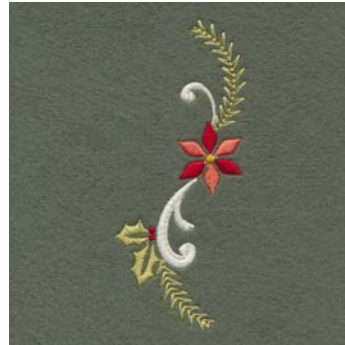
12470-26 Poinsettia 6 1.74 X 4.14 in. 44.20 X 105.16 mm 2,205 St. ⚙️