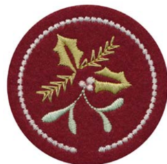
12470-10 Cupcake Decoration 1 2.51 X 2.51 in. 63.75 X 63.75 mm 2,249 St. ❄️