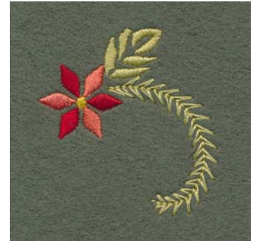
12470-27 Poinsettia 7 2.01 X 2.12 in. 51.05 X 53.85 mm 1,274 St. ⚙️