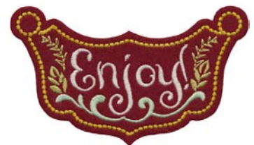
12470-12 Enjoy Wine Label 4.59 X 2.72 in. 116.59 X 69.09 mm 6,034 St. ❄️