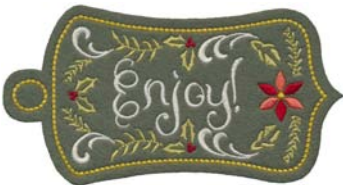
12470-05 Enjoy Tag 6.38 X 3.38 in. 162.05 X 85.85 mm 10,676 St. ❄️ L