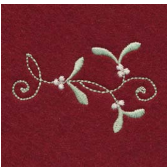
12470-32 Mistletoe 2 2.30 X 1.49 in. 58.42 X 37.85 mm 1,204 St. ⚙️ S