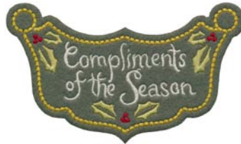
12470-14 Compliments Wine Tag 4.59 X 2.72 in. 116.59 X 69.09 mm 7,103 St. ❄️