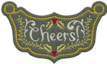
12470-13 Cheers Wine Label 4.59 X 2.72 in. 116.59 X 69.09 mm 5,886 St. ❄️

Note: Some designs in this collection may have been created using unique special stitches and/or techniques. To preserve design integrity when rescaling or rotating designs in your software, always rescale or rotate designs using the handles directly on-screen.