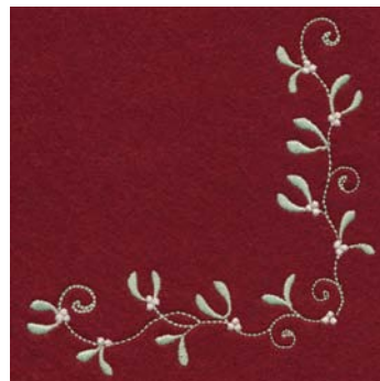
12470-30 Mistletoe Corner 3.98 X 4.12 in. 101.09 X 104.65 mm 2,970 St. ⚙️