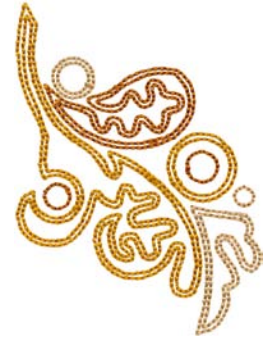
12528-04 Modern Feather 3 2.23 X 3.09 in. 56.64 X 78.49 mm 7,477 St. ✿