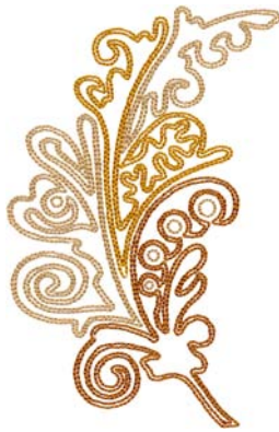
12528-02 Modern Feather 1 3.35 X 5.16 in. 85.09 X 131.06 mm 19,816 St. ✿ L