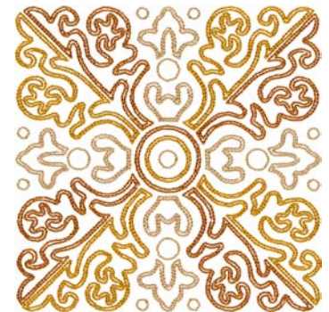
12528-12 Modern Square 4.88 X 4.88 in. 123.95 X 123.95 mm 39,852 St. ✿