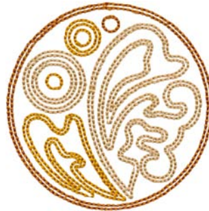
12528-15 Modern Circle 3 2.47 X 2.47 in. 62.74 X 62.74 mm 8,757 St. ⚙️