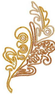
12528-03 Modern Feather 2 3.01 X 5.14 in. 76.45 X 130.56 mm 16,201 St. ✿ L