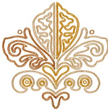
12528-10 Modern Leaf Pattern 4.37 X 4.37 in. 111.00 X 111.00 mm 20,588 St. ✿