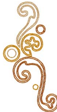
12528-19 Modern Swirl Accent 1 2.09 X 4.17 in. 53.09 X 105.92 mm 6,849 St. ⚙️