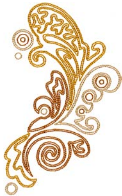
12528-05 Modern Swirls 1 3.33 X 5.45 in. 84.58 X 138.43 mm 18,371 St. ✿ L