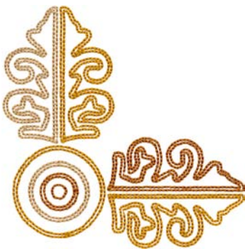
12528-17 Modern Leaf Corner 3.45 X 3.45 in. 87.63 X 87.63 mm 12,341 St. ⚙️