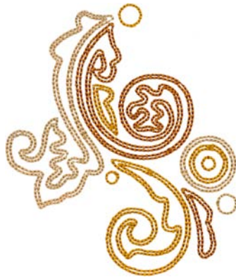
12528-06 Modern Swirls 2 3.13 X 3.67 in. 79.50 X 93.22 mm 11,304 St. ✿