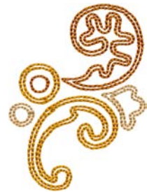
12528-20 Modern Swirl Accent 2 1.72 X 2.37 in. 43.69 X 60.20 mm 4,839 St. ⚙️