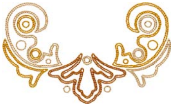
12528-09 Modern Swirls Center 4.62 X 2.78 in. 117.35 X 70.61 mm 11,754 St. ✿