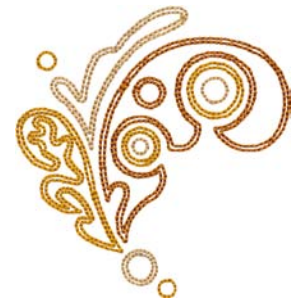
12528-08 Modern Paisley 2 2.95 X 3.13 in. 74.93 X 79.50 mm 7,951 St. ✿