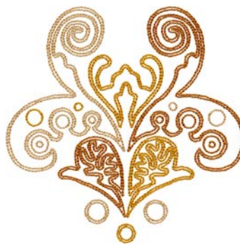
12528-11 Modern Pattern 4.37 X 4.29 in. 111.00 X 108.97 mm 19,356 St. ✿