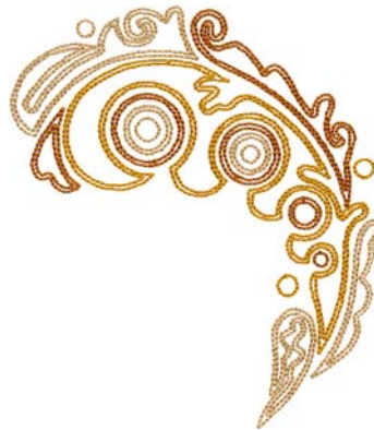
12528-07 Modern Paisley 1 4.09 X 4.65 in. 103.89 X 118.11 mm 15,359 St. ✿