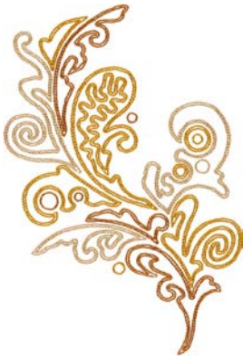
12528-01 Modern Feathers 4.65 X 6.83 in. 118.11 X 173.48 mm 26,757 St. ✿ L

Note: Some designs in this collection may have been created using unique special stitches and/or techniques. To preserve design integrity when rescaling or rotating designs in your software, always rescale or rotate designs using the handles directly on-screen.