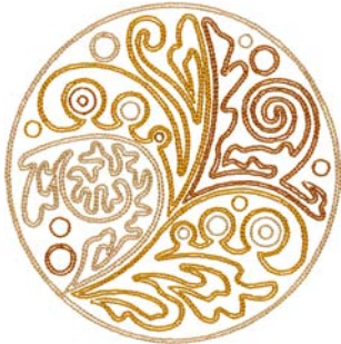
12528-13 Modern Circle 1 4.81 X 4.81 in. 122.17 X 122.17 mm 29,225 St. ⚙️

Note: Some designs in this collection may have been created using unique special stitches and/or techniques. To preserve design integrity when rescaling or rotating designs in your software, always rescale or rotate designs using the handles directly on-screen.