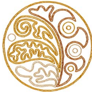
12528-14 Modern Circle 2 3.47 X 3.47 in. 88.14 X 88.14 mm 15,497 St. ⚙️