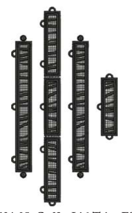
12534-05 Coffin Lid Trim FSL

4.19 X 6.80 in. 106.43 X 172.72 mm 29,154 St. ₩ L