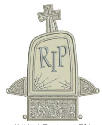
12534-06 Tombstone FSA

3.65 X 6.81 in. 92.71 X 172.97 mm 25,652 St. ₩ ∴ L