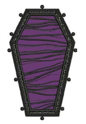
12534-01 Coffin Floor FSA 3.98 X 6.61 in.

Note: Some designs in this collection may have been created using unique special stitches and/or techniques. To preserve design integrity when rescaling or rotating designs in your software, always rescale or rotate designs using the handles directly on-screen.