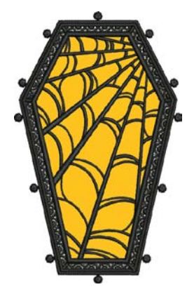
12534-04 Coffin Lid FSA

3.62 X 2.30 in. 91.95 X 58.42 mm 10,825 St. #