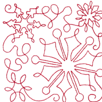
12542-17 Snow Quilt Square

3.51 X 3.44 in. 89.15 X 87.38 mm 2,929 St. ❄️