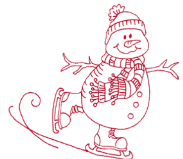
12542-12 Ice Skating Snowman 4.92 X 4.58 in. 124.97 X 116.33 mm 5,207 St. ⚙