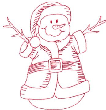
12542-14 Santa Snowman

6.64 X 4.30 in. 168.66 X 109.22 mm 8,953 St. ❄️ L