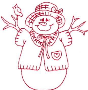
12542-09 Mrs. Snowman 3.77 X 3.85 in. 95.76 X 97.79 mm 3,870 St. ⚙