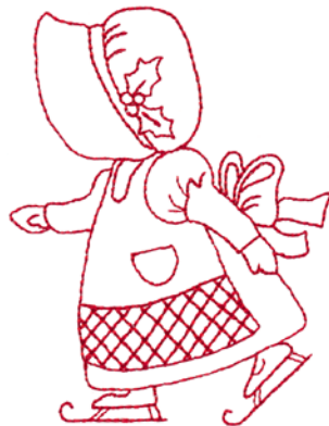
12542-06 Ice Skating Sue 2.73 X 3.56 in. 69.34 X 90.42 mm 3,289 St. ⚙