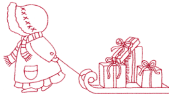
12542-02 Christmas Sleigh Sue 6.42 X 3.54 in. 163.07 X 89.92 mm 5,467 St. ⚙ L