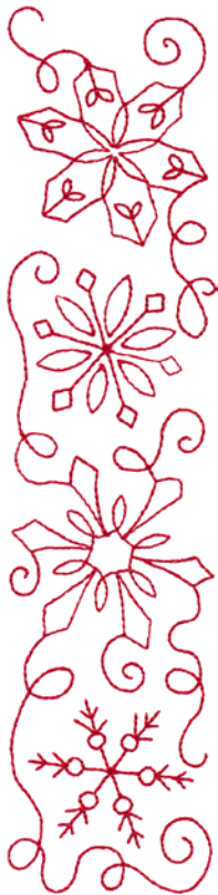
12542-15 Snow Quilt Border

5.29 X 5.53 in. 134.37 X 140.46 mm 5,364 St. ❄️ L