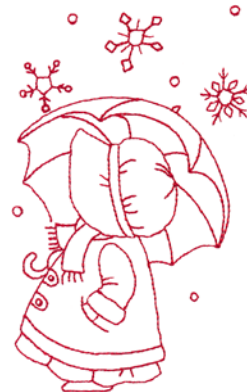
12542-07 Snowfall Sue 3.18 X 5.14 in. 80.77 X 130.56 mm 4,052 St. ⚙ L