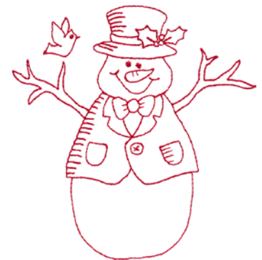
12542-08 Mr. Snowman 3.85 X 4.05 in. 97.79 X 102.87 mm 3,161 St. ⚙