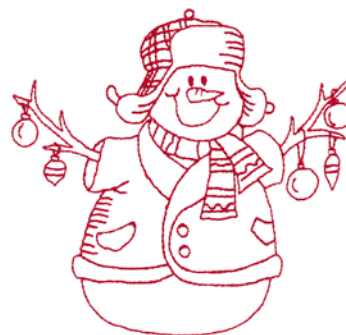
12542-11 Ornaments Snowman 4.20 X 4.05 in. 106.68 X 102.87 mm 4,745 St. ⚙