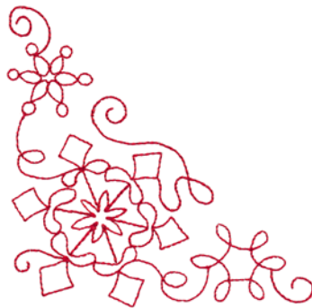
12542-16 Snow Quilt Corner

1.80 X 7.83 in. 45.72 X 198.88 mm 5,544 St. ❄️ L