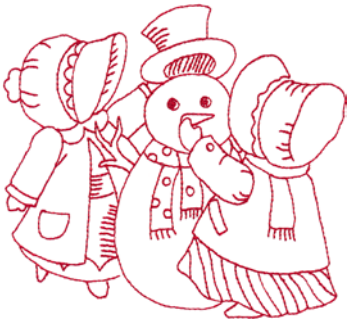
12542-01 Building a Snowman Susies 4.68 X 4.35 in. 118.87 X 110.49 mm 6,305 St. ⚙

Note: Some designs in this collection may have been created using unique special stitches and/or techniques. To preserve design integrity when rescaling or rotating designs in your software, always rescale or rotate designs using the handles directly on-screen.