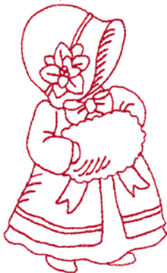
12542-05 Hand Muff Sue 2.27 X 3.77 in. 57.66 X 95.76 mm 2,914 St. ⚙