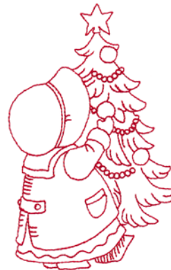
12542-03 Christmas Tree Sue 2.97 X 4.80 in. 75.44 X 121.92 mm 4,455 St. ⚙