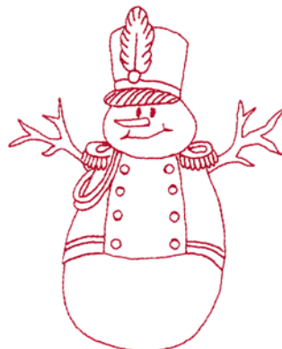
12542-10 Band Snowman 3.66 X 4.57 in. 92.96 X 116.08 mm 3,424 St. ⚙