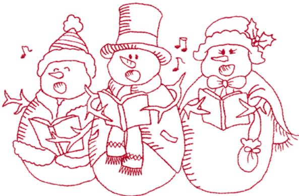
12542-13 Caroling Snowman

Note: Some designs in this collection may have been created using unique special stitches and/or techniques. To preserve design integrity when rescaling or rotating designs in your software, always rescale or rotate designs using the handles directly on-screen.