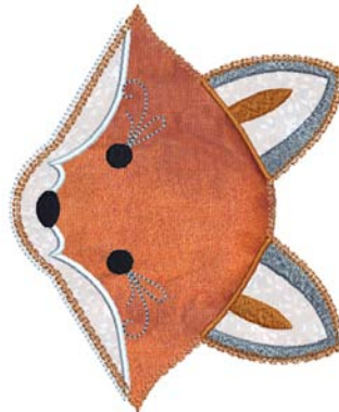
12546-02 Fox Front 5.01 X 6.01 in. 127.25 X 152.65 mm 9,791 St.

Listings below indicate color sample, stitching order and suggested thread color number. Most numbers indicate Isacord thread. Colors beginning with 20501 refer to YLI Fine Metallics, 7 refer to Yenmet Metallic, 8 refer to YLI Variations Variegated Thread and 9 refer to Isacord Multicolor Variegated.