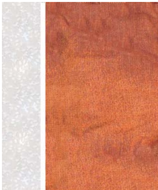
12546-01 Fox Back 5.01 X 6.01 in. 127.25 X 152.65 mm 1,219 St.

Note: Some designs in this collection may have been created using unique special stitches and/or techniques. To preserve design integrity when rescaling or rotating designs in your software, always rescale or rotate designs using the handles directly on-screen.