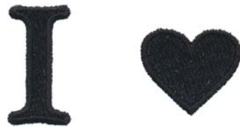
12558-06 I Love 2.83 X 1.48 in. 71.88 X 37.59 mm 3,170 St. S