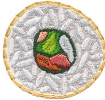
12558-03 Tempura Uramaki 1.80 X 1.73 in. 45.72 X 43.94 mm 7,685 St.