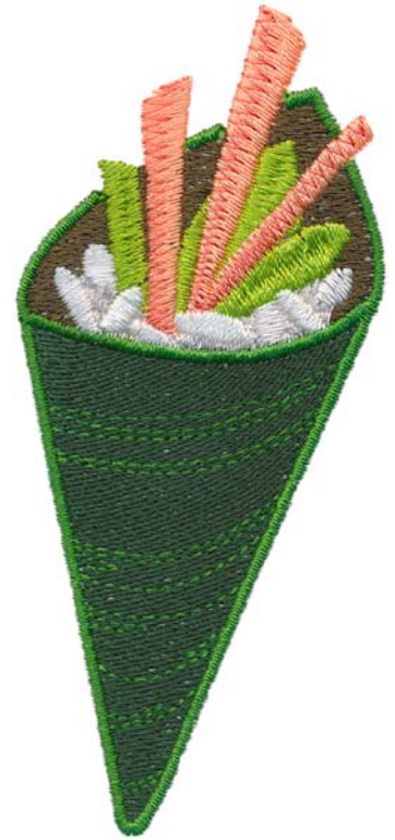
12558-04 Temaki 1.67 X 3.77 in. 42.42 X 95.76 mm 8,190 St.