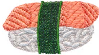
12558-02 Nigiri 2.33 X 1.33 in. 59.18 X 33.78 mm 6,376 St. S