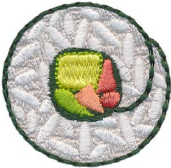
12558-01 Makizushi 1.62 X 1.60 in. 41.15 X 40.64 mm 6,741 St.

Note: Some designs in this collection may have been created using unique special stitches and/or techniques. To preserve design integrity when rescaling or rotating designs in your software, always rescale or rotate designs using the handles directly on-screen.