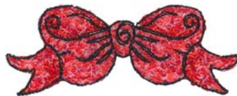
12577-10 Stipple Scribble Bow 4.51 X 1.71 in. 114.55 X 43.43 mm 13,883 St. ⌘