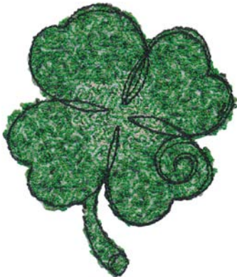
12577-05 Stipple Scribble Clover 3.83 X 4.46 in. 97.28 X 113.28 mm 26,310 St. ⌘