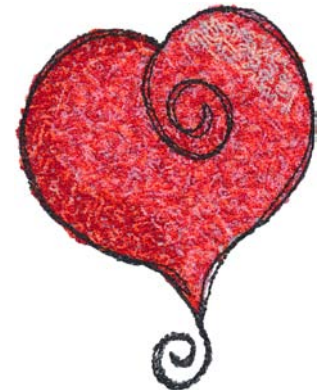
12577-08 Stipple Scribble Heart 3.65 X 4.75 in. 92.71 X 120.65 mm 25,556 St. ⌘