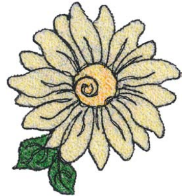
12577-04 Stipple Scribble Daisy 4.05 X 4.53 in. 102.87 X 115.06 mm 30,993 St. ⌘