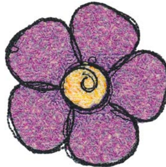
12577-03 Stipple Scribble Flower 3.66 X 3.75 in. 92.96 X 95.25 mm 26,574 St. ⌘