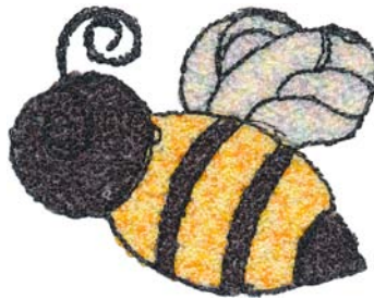
12577-06 Stipple Scribble Bee 3.05 X 2.43 in. 77.47 X 61.72 mm 14,396 St. ⌘