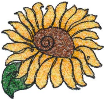
12577-01 Stipple Scribble Sunflower 3.78 X 3.89 in. 96.01 X 98.81 mm 27,744 St. ⌘

Note: Some designs in this collection may have been created using unique special stitches and/or techniques. To preserve design integrity when rescaling or rotating designs in your software, always rescale or rotate designs using the handles directly on-screen.