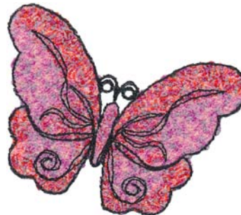
12577-07 Stipple Scribble Butterfly 3.77 X 3.42 in. 95.76 X 86.87 mm 21,163 St. ⌘