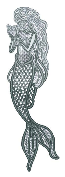
12635-02 Ombre Mermaid Bookmark FSL 2.19 X 6.76 in. 55.63 X 171.70 mm 17,756 St.