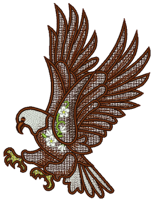
12637-01 Bald Eagle FSL 4.33 X 5.77 in. 109.98 X 146.56 mm 29,631 St.

Note: Some designs in this collection may have been created using unique special stitches and/or techniques. To preserve design integrity when rescaling or rotating designs in your software, always rescale or rotate designs using the handles directly on-screen.