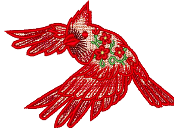
12637-03 Cardinal FSL 4.63 X 3.41 in. 117.60 X 86.61 mm 17,375 St.