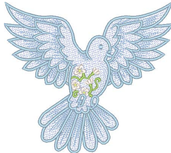
12637-02 Dove FSL 4.69 X 4.22 in. 119.13 X 107.19 mm 21,691 St.