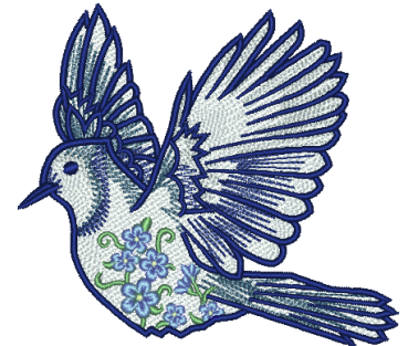
12637-04 Blue Jay FSL 4.47 X 4.03 in. 113.54 X 102.36 mm 26,900 St.