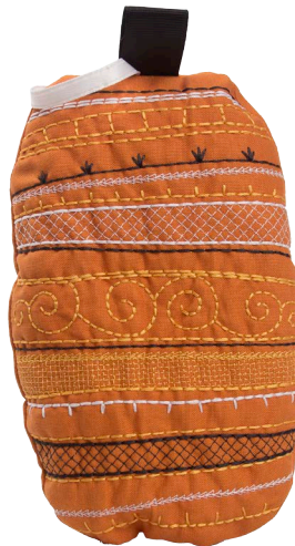
12639-05 Stitch 'N' Turn Pumpkin 5 4.96 X 7.11 .in 125.98 X 180.59 mm 9,743 St.