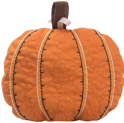
12639-01 Stitch 'N' Turn Pumpkin 1 6.37 X 5.47 .in 161.80 X 138.94 mm 8,614 St.

Note: Some designs in this collection may have been created using unique special stitches and/or techniques. To preserve design integrity when rescaling or rotating designs in your software, always rescale or rotate designs using the handles directly on-screen.