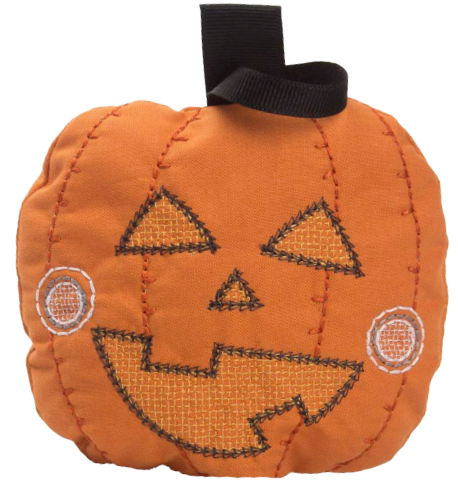
12639-03 Stitch 'N' Turn Pumpkin 3 5.31 X 4.92 .in 134.87 X 124.97 mm 6,246 St.