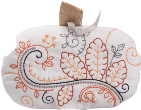
12639-04 Stitch 'N' Turn Pumpkin 4 6.31 X 4.35 .in 160.27 X 110.49 mm 7,480 St.