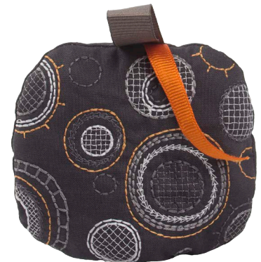
12639-06 Stitch 'N' Turn Pumpkin 6 4.59 X 4.21 .in 116.59 X 106.93 mm 6,368 St.