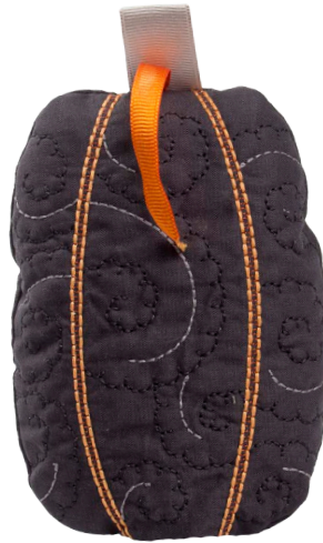
12639-02 Stitch 'N' Turn Pumpkin 2 4.71 X 6.26 .in 119.63 X 159.00 mm 7,658 St.