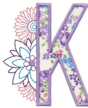
12653-11 Floral Appliqué K 3.04 X 3.52 in. 77.22 X 89.41 mm 5,472 St.