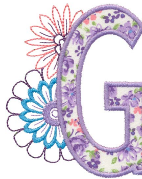
12653-07 Floral Appliqué G 2.93 X 3.65 in. 74.42 X 92.71 mm 7,042 St.