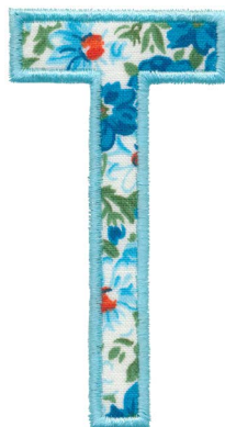
12653-46 Appliqué T 1.83 X 3.52 in. 46.48 X 89.41 mm 2,067 St.