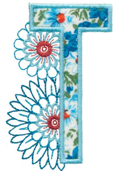
12653-20 Floral Appliqué T 2.33 X 3.67 in. 59.18 X 93.22 mm 7,162 St.