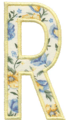
12653-44 Appliqué R 1.83 X 3.52 in. 46.48 X 89.41 mm 3,327 St.