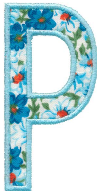
12653-42 Appliqué P 1.75 X 3.53 in. 44.45 X 89.66 mm 2,681 St.