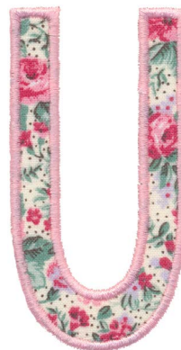
12653-47 Appliqué U 1.83 X 3.59 in. 46.48 X 91.19 mm 2,974 St.