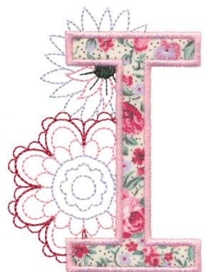
12653-09 Floral Appliqué I 2.79 X 3.86 in. 70.87 X 98.04 mm 5,805 St.