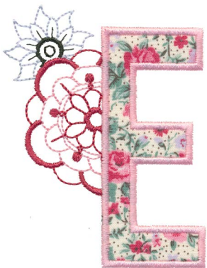
12653-05 Floral Appliqué E 2.94 X 3.84 in. 74.68 X 97.54 mm 6,131 St.