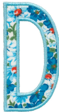
12653-30 Appliqué D 1.83 X 3.52 in. 46.48 X 89.41 mm 3,067 St.