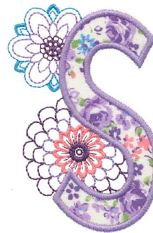
12653-19 Floral Appliqué S 2.48 X 3.74 in. 62.99 X 95.00 mm 7,669 St.