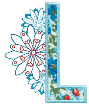
12653-12 Floral Appliqué L 2.86 X 3.52 in. 72.64 X 89.41 mm 4,731 St.