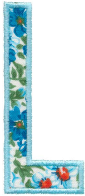
12653-38 Appliqué L 1.46 X 3.52 in. 37.08 X 89.41 mm 1,911 St.