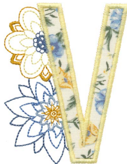
12653-22 Floral Appliqué V 2.74 X 3.54 in. 69.60 X 89.92 mm 5,798 St.