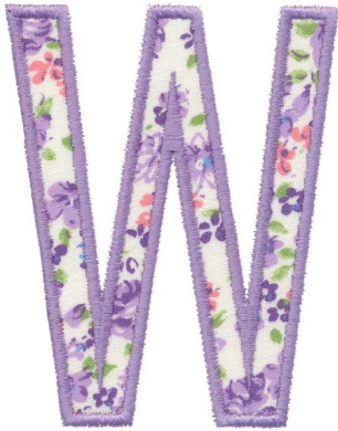
12653-49 Appliqué W 2.77 X 3.52 in. 70.36 X 89.41 mm 4,965 St.

Note: Some designs in this collection may have been created using unique special stitches and/or techniques. To preserve design integrity when rescaling or rotating designs in your software, always rescale or rotate designs using the handles directly on-screen.