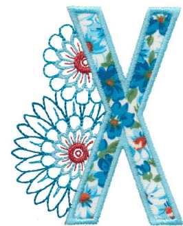
12653-24 Floral Appliqué X 2.78 X 3.52 in. 70.61 X 89.41 mm 7,341 St.