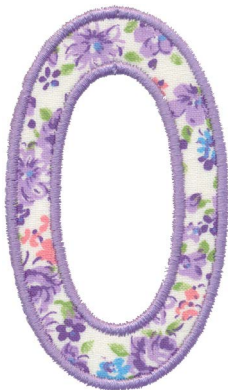
12653-41 Appliqué O 2.12 X 3.65 in. 53.85 X 92.71 mm 3,056 St.