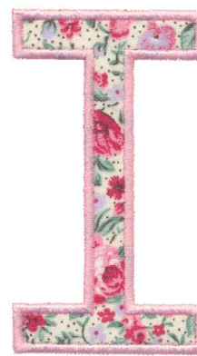
12653-35 Appliqué I 1.97 X 3.53 in. 50.04 X 89.66 mm 2,720 St.