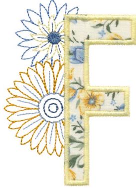
12653-06 Floral Appliqué F 2.70 X 3.83 in. 68.58 X 97.28 mm 4,691 St.