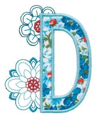
12653-04 Floral Appliqué D 3.04 X 3.80 in. 77.22 X 96.52 mm 5,796 St.