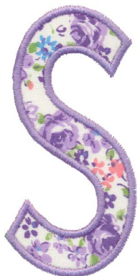
12653-45 Appliqué S 1.76 X 3.65 in. 44.70 X 92.71 mm 2,535 St.