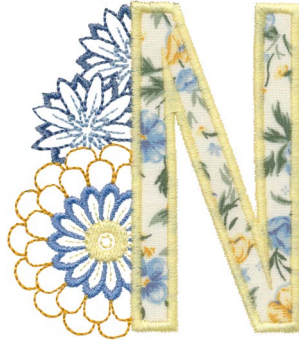
12653-14 Floral Appliqué N 3.11 X 3.59 in. 78.99 X 91.19 mm 8,928 St.