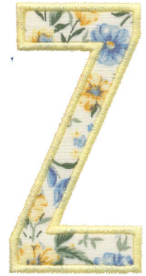
12653-52 Appliqué Z 1.72 X 3.52 in. 43.69 X 89.41 mm 2,483 St.