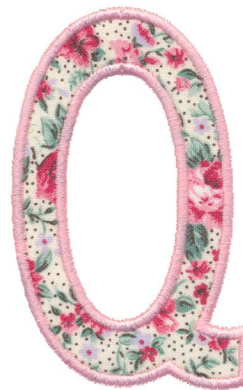
12653-43 Appliqué Q 2.29 X 3.67 in. 58.17 X 93.22 mm 3,309 St.