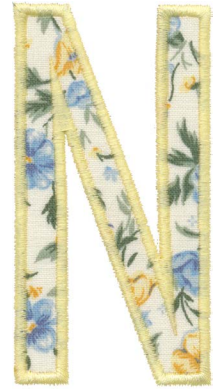
12653-40 Appliqué N 1.82 X 3.52 in. 46.23 X 89.41 mm 3,795 St.