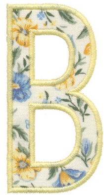
12653-28 Appliqué B 1.77 X 3.52 in. 44.96 X 89.41 mm 3,303 St.