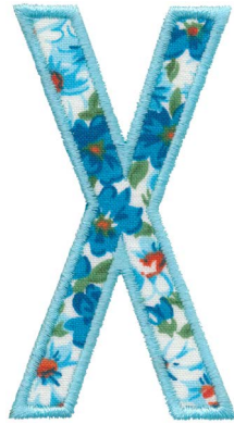
12653-50 Appliqué X 1.94 X 3.52 in. 49.28 X 89.41 mm 2,897 St.