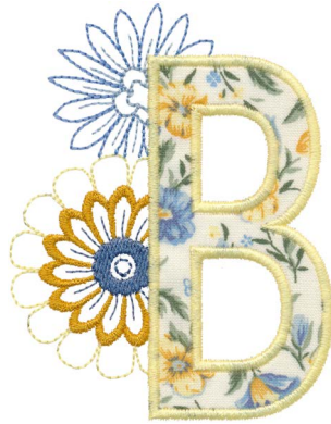
12653-02 Floral Appliqué B 3.08 X 4.03 in. 78.23 X 102.36 mm 7,992 St.