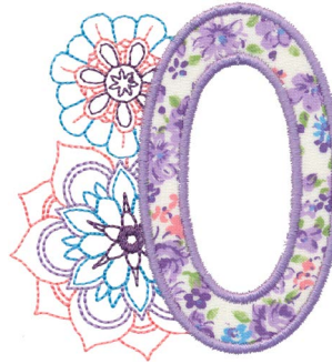
12653-15 Floral Appliqué O 3.43 X 3.72 in. 87.12 X 94.49 mm 6,669 St.