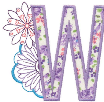
12653-23 Floral Appliqué W 3.76 X 3.63 in. 95.50 X 92.20 mm 8,145 St.