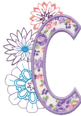
12653-03 Floral Appliqué C 2.86 X 4.11 in. 72.64 X 104.39 mm 5,317 St.