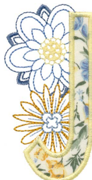
12653-10 Floral Appliqué J 1.85 X 3.74 in. 46.99 X 95.00 mm 5,408 St.