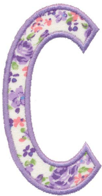
12653-29 Appliqué C 1.87 X 3.65 in. 47.50 X 92.71 mm 2,294 St.