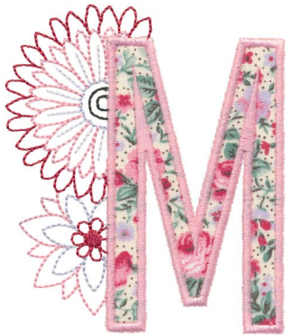
12653-13 Floral Appliqué M 3.32 X 3.89 in. 84.33 X 98.81 mm 8,160 St.

Note: Some designs in this collection may have been created using unique special stitches and/or techniques. To preserve design integrity when rescaling or rotating designs in your software, always rescale or rotate designs using the handles directly on-screen.