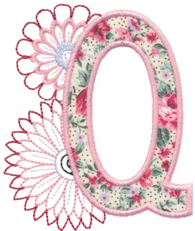
12653-17 Floral Appliqué Q 3.31 X 3.99 in. 84.07 X 101.35 mm 8,176 St.