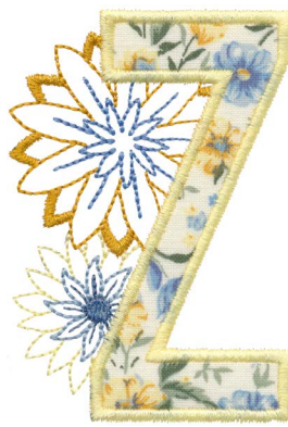
12653-26 Floral Appliqué Z 2.41 X 3.52 in. 61.21 X 89.41 mm 5,324 St.