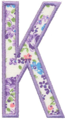
12653-37 Appliqué K 1.93 X 3.52 in. 49.02 X 89.41 mm 3,067 St.

Note: Some designs in this collection may have been created using unique special stitches and/or techniques. To preserve design integrity when rescaling or rotating designs in your software, always rescale or rotate designs using the handles directly on-screen.