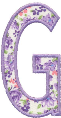
12653-33 Appliqué G 1.91 X 3.65 in. 48.51 X 92.71 mm 3,055 St.