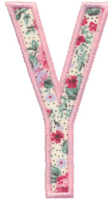
12653-51 Appliqué Y 1.91 X 3.52 in. 48.51 X 89.41 mm 2,331 St.