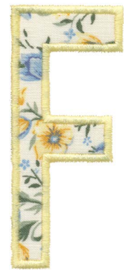
12653-32 Appliqué F 1.49 X 3.52 in. 37.85 X 89.41 mm 2,274 St.