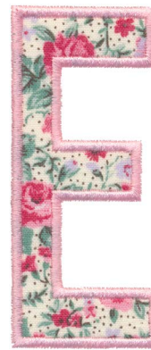
12653-31 Appliqué E 1.52 X 3.52 in. 38.61 X 89.41 mm 2,565 St.