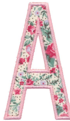
12653-27 Appliqué A 2.09 X 3.52 in. 53.09 X 89.41 mm 2,825 St.