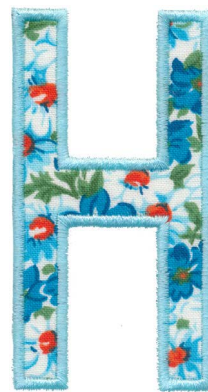
12653-34 Appliqué H 1.84 X 3.52 in. 46.74 X 89.41 mm 3,198 St.