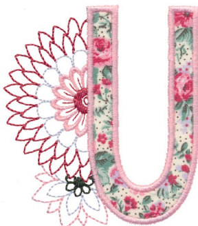
12653-21 Floral Appliqué U 3.18 X 3.66 in. 80.77 X 92.96 mm 7,100 St.