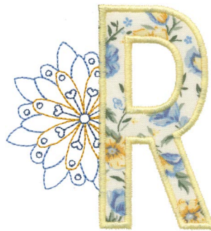
12653-18 Floral Appliqué R 3.27 X 3.52 in. 83.06 X 89.41 mm 5,192 St.