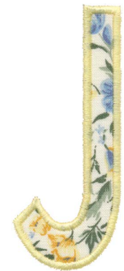
12653-36 Appliqué J 1.47 X 3.59 in. 37.34 X 91.19 mm 1,878 St.