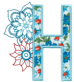
12653-08 Floral Appliqué H 3.14 X 3.61 in. 79.76 X 91.69 mm 6,347 St.