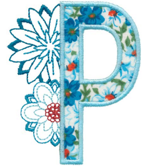
12653-16 Floral Appliqué P 2.88 X 3.53 in. 73.15 X 89.66 mm 5,902 St.