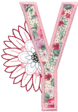
12653-25 Floral Appliqué Y 2.50 X 3.52 in. 63.50 X 89.41 mm 4,489 St.

Note: Some designs in this collection may have been created using unique special stitches and/or techniques. To preserve design integrity when rescaling or rotating designs in your software, always rescale or rotate designs using the handles directly on-screen.