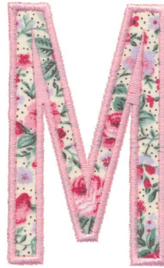
12653-39 Appliqué M 2.13 X 3.52 in. 54.10 X 89.41 mm 4,583 St.