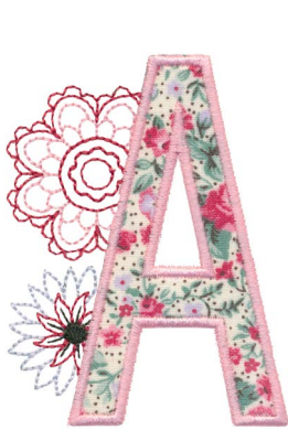
12653-01 Floral Appliqué A 2.66 X 3.52 in. 67.56 X 89.41 mm 4,960 St.

Note: Some designs in this collection may have been created using unique special stitches and/or techniques. To preserve design integrity when rescaling or rotating designs in your software, always rescale or rotate designs using the handles directly on-screen.