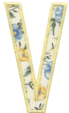
12653-48 Appliqué V 2.02 X 3.52 in. 51.31 X 89.41 mm 2,750 St.