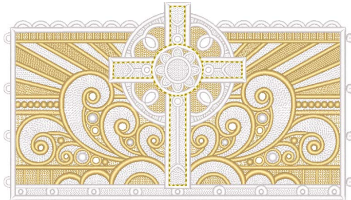
12658-01 Wonderful Cross Tea Light Holder Wall FSL

Note: Some designs in this collection may have been created using unique special stitches and/or techniques. To preserve design integrity when rescaling or rotating designs in your software, always rescale or rotate designs using the handles directly on-screen.