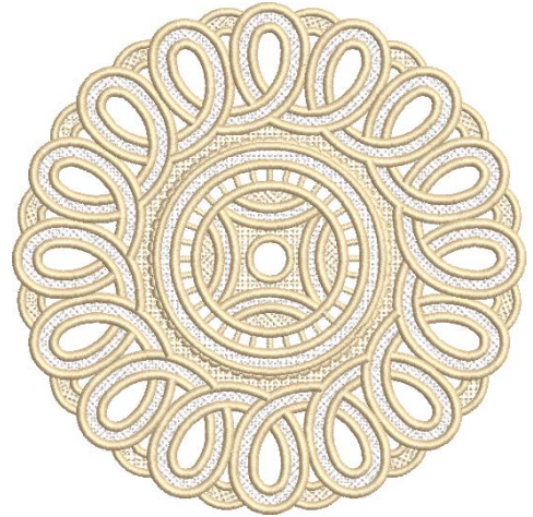
12671-03 Modern Doily FSL

5.50 X 5.50 in. 139.70 X 139.70 mm 51,163 St.