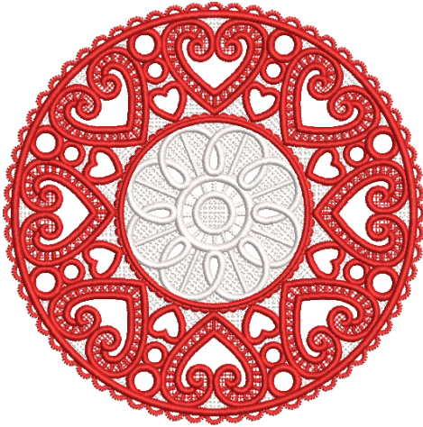
12671-01 Valentine's Doily FSL

Note: Some designs in this collection may have been created using unique special stitches and/or techniques. To preserve design integrity when rescaling or rotating designs in your software, always rescale or rotate designs using the handles directly on-screen.