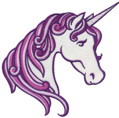
12672-02 Sad Unicorn

5.44 X 5.41 in. 138.18 X 137.41 mm 31,059 St.