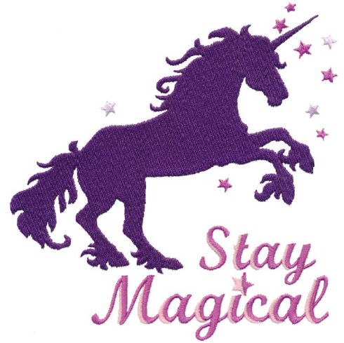
12672-03 Stay Magical Unicorn

5.44 X 5.25 in. 138.18 X 133.35 mm 32,544 St.