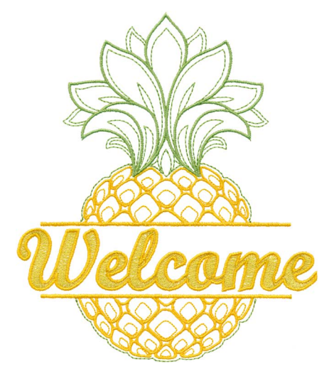
12675-04 Pineapple Welcome 5.21~\mathrm{X} 6.15 in. 132.33 X 156.21 mm 24,284 St.