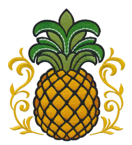
12675-01 Fancy Pineapple 4.80 X 5.48 in. 121.92 X 139.19 mm 40,039 St.

Note: Some designs in this collection may have been created using unique special stitches and/or techniques. To preserve design integrity when rescaling or rotating designs in your software, always rescale or rotate designs using the handles directly on-screen.