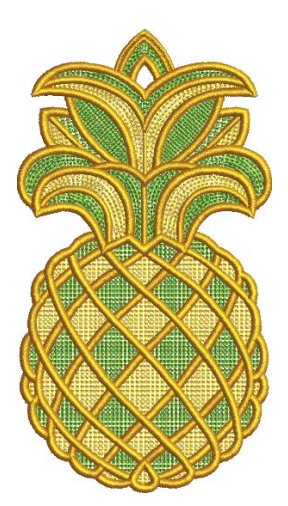
12675-02 Pineapple FSL 3.09 X 5.63 in. 78.49 \times 143.00 \text{ mm} 38,012 St.