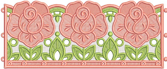
12687-01 Rose Tea Light Holder

Note: Some designs in this collection may have been created using unique special stitches and/or techniques. To preserve design integrity when rescaling or rotating designs in your software, always rescale or rotate designs using the handles directly on-screen.