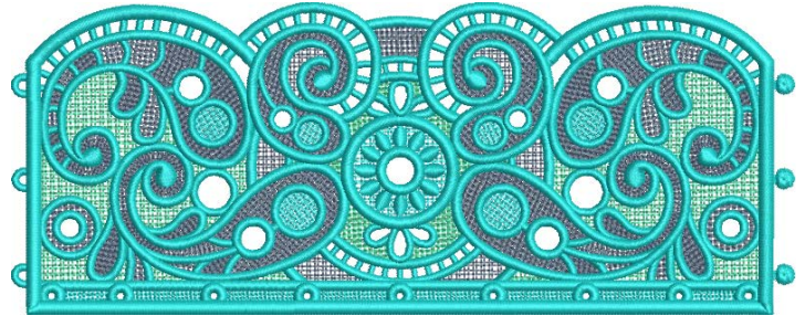
12687-02 Paisley Tea Light Holder

8.26 X 3.35 in. 209.80 X 85.09 mm 77,343 St.