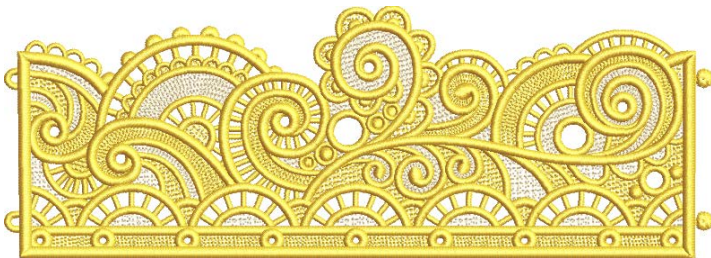
12687-03 Sunshine Swirls Tea Light Holder

8.25 X 3.30 in. 209.55 X 83.82 mm 70,080 St.