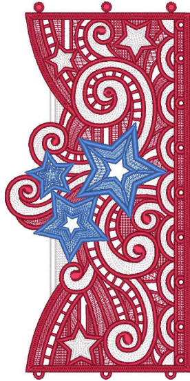
12699-03 Swirly Stars Tea Light Holder FSL

Note: Some designs in this collection may have been created using unique special stitches and/or techniques. To preserve design integrity when rescaling or rotating designs in your software, always rescale or rotate designs using the handles directly on-screen.