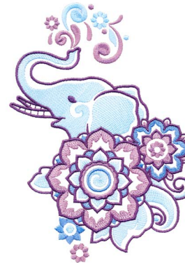
12709-03 Floral Elephant 5.36 X 7.59 in. 136.14 X 192.79 mm 31,261 St.

Listings below indicate color sample, stitching order and suggested thread color number. Most numbers indicate Isacord thread. Colors beginning with 20501 refer to YLI Fine Metallics, 7 refer to Yenmet Metallic, 8 refer to YLI Variations Variegated Thread and 9 refer to Isacord Multicolor Variegated.