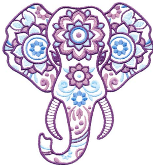
12709-01 Floral Elephant Head 5.42 X 5.87 in. 137.67 X 149.10 mm 30,700 St.

Note: Some designs in this collection may have been created using unique special stitches and/or techniques. To preserve design integrity when rescaling or rotating designs in your software, always rescale or rotate designs using the handles directly on-screen.