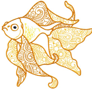
12712-01 Fantasy Goldfish

Note: Some designs in this collection may have been created using unique special stitches and/or techniques. To preserve design integrity when rescaling or rotating designs in your software, always rescale or rotate designs using the handles directly on-screen.