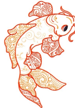
12712-03 Fantasy Koi

5.43 X 6.12 in. 137.92 X 155.45 mm 21,608 St.