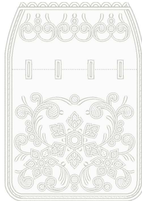
12727-02 Snowflakes Bag FSA 5.15 X 7.33 in. 130.81 X 186.18 mm 41,451 St.