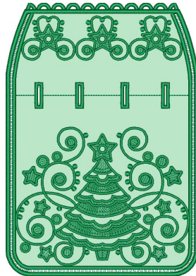
12727-01 Christmas Tree Bag FSA 5.15 X 7.33 in. 130.81 X 186.18 mm 41,778 St.

Note: Some designs in this collection may have been created using unique special stitches and/or techniques. To preserve design integrity when rescaling or rotating designs in your software, always rescale or rotate designs using the handles directly on-screen.