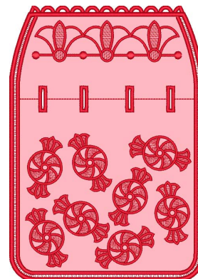
12727-06 Candies Bag FSA 5.15 X 7.33 in. 130.81 X 186.18 mm 36,801 St.

Listings below indicate color sample, stitching order and suggested thread color number. Most numbers indicate Isacord thread.