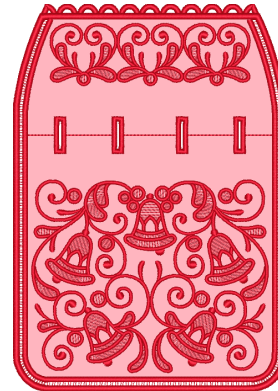
12727-03 Christmas Bells Bag FSA 5.15 X 7.33 in. 130.81 X 186.18 mm 42,923 St.