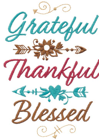
12731-02 Grateful, Thankful, Blessed 3.96 X 5.64 in. 100.58 X 143.26 mm 12,889 St.