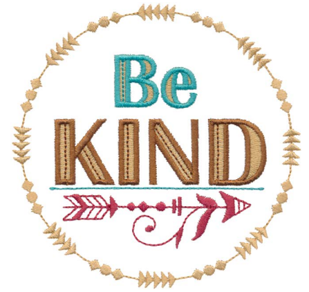
12731-03 Be KIND 4.53 X 4.53 in. 115.06 X 115.06 mm 12,732 St.

Listings below indicate color sample, stitching order and suggested thread color number. Most numbers indicate Isacord thread. Colors beginning with 7 refer to Yenmet Metallic and 9 refer to Isacord Multicolor Variegated.