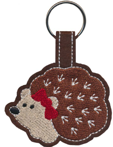
12733-03 Hedgehog Felt Keychain FSA

3.03 X 4.54 in. 76.96 X 115.32 mm 10,468 St.