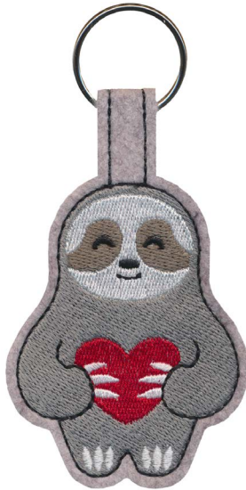
12733-01 Sloth Felt Keychain FSA

Note: Some designs in this collection may have been created using unique special stitches and/or techniques. To preserve design integrity when rescaling or rotating designs in your software, always rescale or rotate designs using the handles directly on-screen.