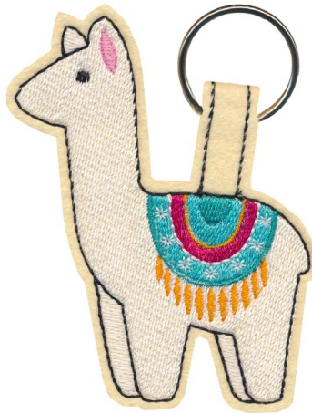
12733-02 Llama Felt Keychain FSA

2.43 X 5.48 in. 61.72 X 139.19 mm 10,260 St.