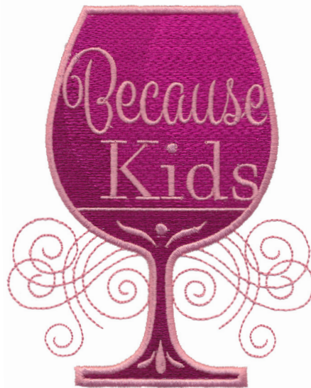
12738-02 Because Kids 4.16 X 5.23 in. 105.66 X 132.84 mm 24,036 St.