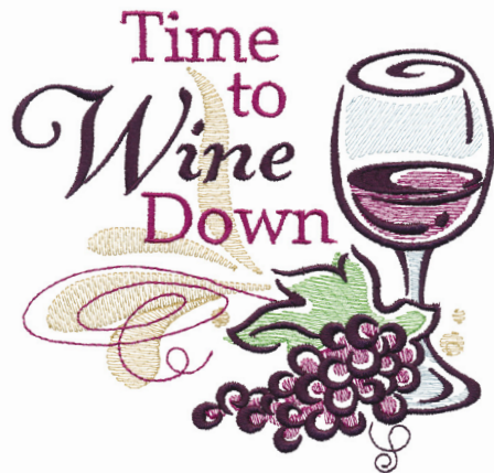
12738-01 Time to Wine Down 4.96 X 4.77 in. 125.98 X 121.16 mm 16,311 St.

Note: Some designs in this collection may have been created using unique special stitches and/or techniques. To preserve design integrity when rescaling or rotating designs in your software, always rescale or rotate designs using the handles directly on-screen.