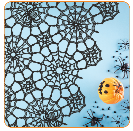
Largest Design: 6.00 x 6.00 in. Project size will be determined by end-user.