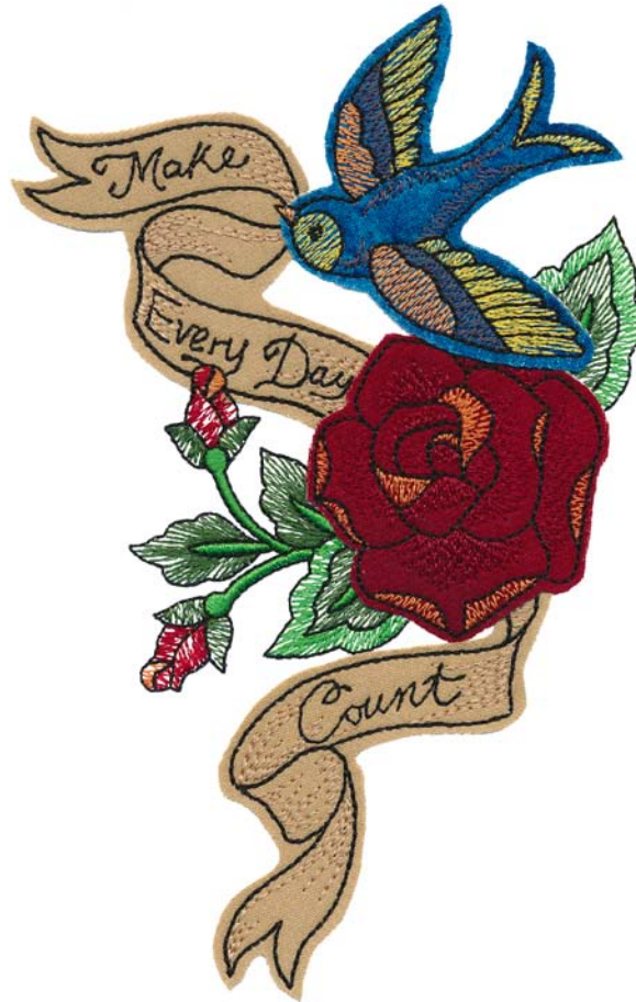
19999-036 Make Every Day Count Appliqué 4.36 X 6.90 in. 110.74 X 175.26 mm 14,372 St. ⚡ ⚙ L

Note: Some designs in this collection may have been created using unique special stitches and/or techniques. To preserve design integrity when rescaling or rotating designs in your software, always rescale or rotate designs using the handles directly on-screen.