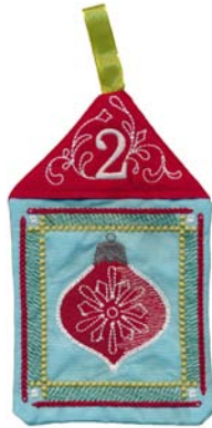
21025-02 Day 2 5.61 X 6.99 in. 142.49 X 177.55 mm 13,418 St. ⚡ ⚙ L