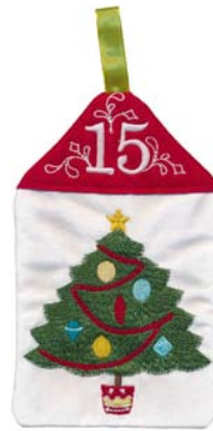
21025-15 Day 15 5.61 X 6.99 in. 142.49 X 177.55 mm 12,585 St. ⚡ ⚙ L