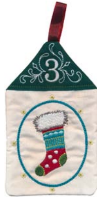
21025-03 Day 3 5.61 X 6.99 in. 142.49 X 177.55 mm 9,925 St. ⚡ ⚙ L