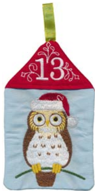
21025-13 Day 13 5.61 X 6.99 in. 142.49 X 177.55 mm 15,897 St. ⚡ ⚙ L

Note: Some designs in this collection may have been created using unique special stitches and/or techniques. To preserve design integrity when rescaling or rotating designs in your software, always rescale or rotate designs using the handles directly on-screen.