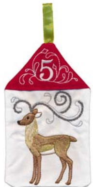
21025-05 Day 5 5.61 X 7.00 in. 142.49 X 177.80 mm 11,664 St. ⚡ ⚙ L