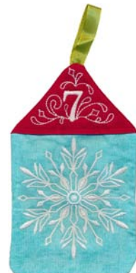
21025-07 Day 7 5.61 X 6.99 in. 142.49 X 177.55 mm 12,359 St. ⚙ L