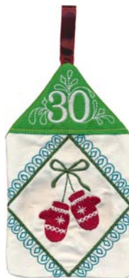
21025-30 Day 30 5.61 X 6.99 in. 142.49 X 177.55 mm 12,297 St. ❄️ L