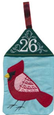
21025-26 Day 26 5.61 X 6.99 in. 142.49 X 177.55 mm 13,075 St. ❄️ L