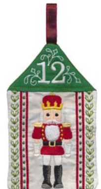
21025-12 Day 12 5.61 X 6.99 in. 142.49 X 177.55 mm 17,657 St. ⚡ ⚙ L