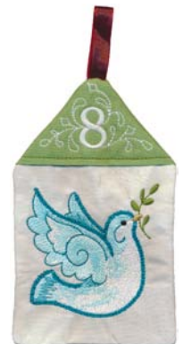
21025-08 Day 8 5.61 X 6.99 in. 142.49 X 177.55 mm 14,496 St. ⚡ ⚙ L