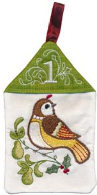
21025-01 Day 1 5.63 X 6.99 in. 143.00 X 177.55 mm 13,870 St. ⚡ ⚙ L

Note: Some designs in this collection may have been created using unique special stitches and/or techniques. To preserve design integrity when rescaling or rotating designs in your software, always rescale or rotate designs using the handles directly on-screen.