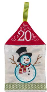
21025-20 Day 20 5.63 X 6.99 in. 143.00 X 177.55 mm 13,703 St. ⚙ L