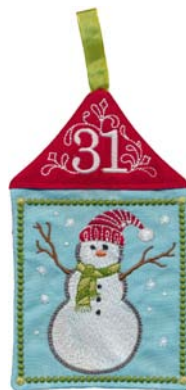
21025-31 Day 31 5.61 X 6.99 in. 142.49 X 177.55 mm 15,095 St. ❄️❄️ L