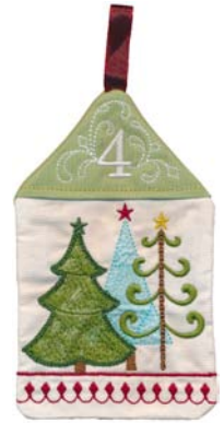
21025-04 Day 4 5.61 X 6.99 in. 142.49 X 177.55 mm 11,926 St. ⚡ ⚙ L