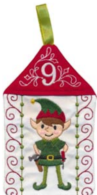
21025-09 Day 9 5.61 X 7.08 in. 142.49 X 179.83 mm 13,450 St. ⚙ L