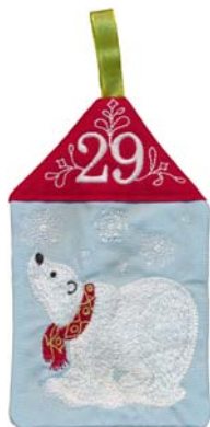
21025-29 Day 29 5.61 X 6.99 in. 142.49 X 177.55 mm 18,375 St. ❄️❄️ L