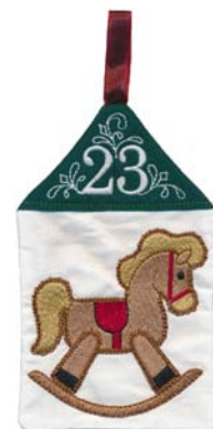
21025-23 Day 23 5.61 X 6.99 in. 142.49 X 177.55 mm 15,222 St. ⚙ L