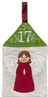
21025-17 Day 17 5.64 X 6.99 in. 143.26 X 177.55 mm 16,461 St. ⚙ L