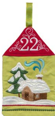
21025-22 Day 22 5.61 X 6.99 in. 142.49 X 177.55 mm 18,554 St. ⚙ L