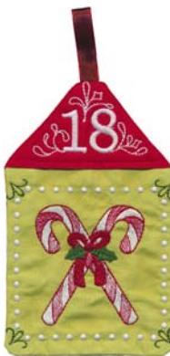
21025-18 Day 18 5.62 X 6.99 in. 142.75 X 177.55 mm 11,902 St. ⚙ L