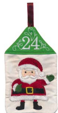
21025-24 Day 24 5.61 X 6.99 in. 142.49 X 177.55 mm 17,001 St. ⚡ ⚙ L