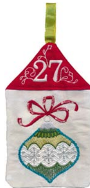
21025-27 Day 27 5.61 X 6.99 in. 142.49 X 177.55 mm 14,288 St. ❄️ L