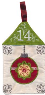
21025-14 Day 14 5.61 X 6.99 in. 142.49 X 177.55 mm 14,788 St. ⚙ L