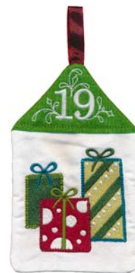
21025-19 Day 19 5.61 X 6.99 in. 142.49 X 177.55 mm 16,254 St. ⚙ L