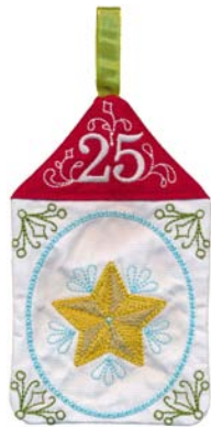
21025-25 Day 25 5.61 X 6.99 in. 142.49 X 177.55 mm 11,692 St. ❄️ L

Note: Some designs in this collection may have been created using unique special stitches and/or techniques. To preserve design integrity when rescaling or rotating designs in your software, always rescale or rotate designs using the handles directly on-screen.