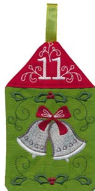
21025-11 Day 11 5.61 X 6.99 in. 142.49 X 177.55 mm 13,082 St. ⚙ L