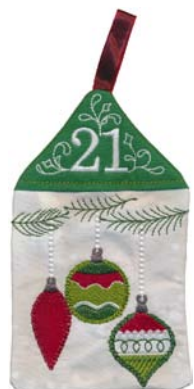
21025-21 Day 21 5.61 X 6.99 in. 142.49 X 177.55 mm 13,442 St. ⚙ L