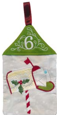
21025-06 Day 6 5.61 X 6.99 in. 142.49 X 177.55 mm 13,155 St. ⚡ ⚙ L