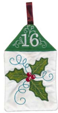
21025-16 Day 16 5.62 X 6.99 in. 142.75 X 177.55 mm 12,390 St. ⚙ L