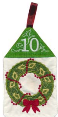
21025-10 Day 10 5.61 X 6.99 in. 142.49 X 177.55 mm 17,004 St. ⚙ L