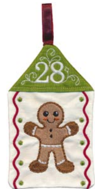
21025-28 Day 28 5.61 X 6.99 in. 142.49 X 177.55 mm 12,665 St. ❄️ L