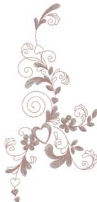
SPR28 Heart Jeans Leg Large 5.06 X 10.71 in. 128.52 X 272.03 mm 9,780 St. L