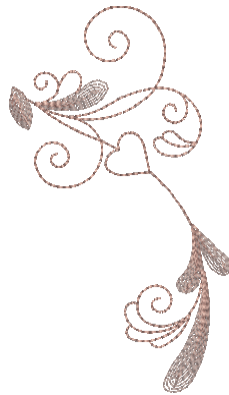
SPR24 Heart Accent 2 2.49 X 4.32 in. 63.25 X 109.73 mm 1,880 St.