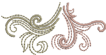
SPR39 Swirls Cuff 2.70 X 1.33 in. 68.58 X 33.78 mm 2,615 St. S