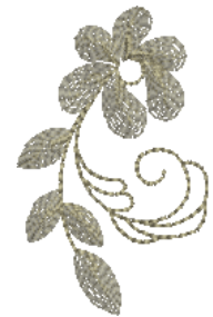
SPR30 Heart Mini 1 1.41 X 2.28 in. 35.81 X 57.91 mm 1,265 St. S