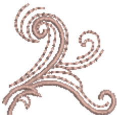
SPR43 Swirls Mini 2 1.23 X 1.19 in. 31.24 X 30.23 mm 1,219 St. S