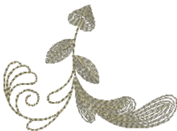
SPR31 Heart Mini 2 2.40 X 1.74 in. 60.96 X 44.20 mm 1,177 St.