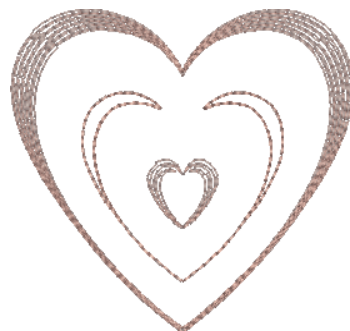
SPR32 Heart Pocket 1 3.09 X 2.88 in. 78.49 X 98.55 mm 1,820 St.