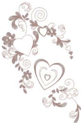
SPR27 Heart Jacket Back 7.91 X 11.80 in. 200.91 X 299.72 mm 15,811 St. L