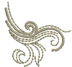
SPR42 Swirls Mini 1 1.49 X 1.43 in. 37.85 X 36.32 mm 1,397 St. S