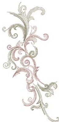
SPR40 Swirls Jeans Leg Large 4.45 X 9.24 in. 113.03 X 234.70 mm 14,707 St. L