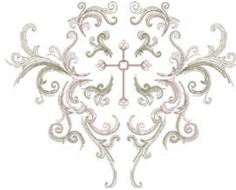
SPR37 Swirls Cross Stencil Jacket Back 8.34 X 11.02 in. 211.84 X 279.91 mm 34,149 St. L