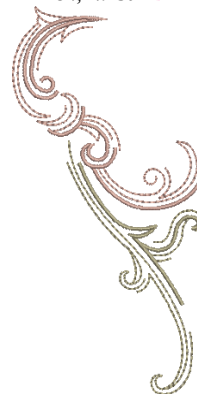
SPR41 Swirls Jeans Leg 2.49 X 4.99 in. 63.25 X 126.75 mm 3,725 St.