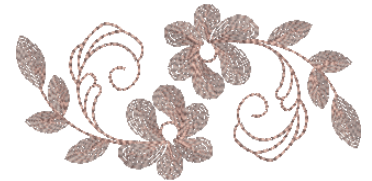
SPR26 Heart Cuff 3.50 X 1.77 in. 88.90 X 44.96 mm 2,566 St.