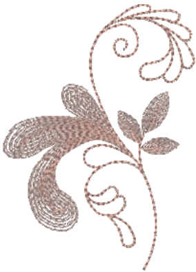
SPR23 Heart Accent 1 2.24 X 3.11 in. 56.90 X 78.99 mm 2,011 St.

Note: Some designs in this collection may have been created using unique special stitches and/or techniques. To preserve design integrity when rescaling or rotating designs in your software, always rescale or rotate designs using the handles directly on-screen.