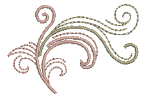
SPR34 Swirls Accent 2.30 X 1.56 in. 58.42 X 39.62 mm 2,247 St.

⌘ Design contains a loose fill. ⚙ Some white areas shown are not stitched.