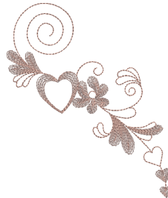
SPR29 Heart Jeans Leg 4.29 X 5.03 in. 108.97 X 127.76 mm 3,427 St. L