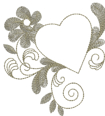
SPR33 Heart Pocket 2 3.68 X 4.49 in. 93.47 X 114.05 mm 4,356 St.