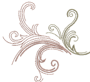
SPR44 Swirls Pocket 3.95 X 3.60 in. 100.33 X 103.89 mm 5,049 St.

⌘ Design contains a loose fill. ⚙ Some white areas shown are not stitched.