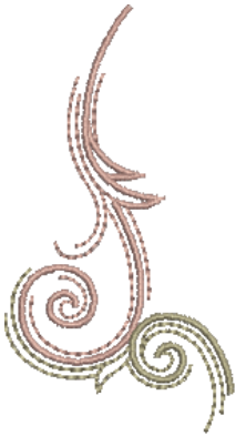
SPR35 Swirls Accent 2 1.67 X 3.10 in. 42.42 X 78.74 mm 2,287 St.

Note: Some designs in this collection may have been created using unique special stitches and/or techniques. To preserve design integrity when rescaling or rotating designs in your software, always rescale or rotate designs using the handles directly on-screen.