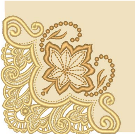
12722-01 Leaf Napkin Corner FSL 4.09 X 4.08 in. 103.89 X 103.63 mm 17,581 St.

Note: Some designs in this collection may have been created using unique special stitches and/or techniques. To preserve design integrity when rescaling or rotating designs in your software, always rescale or rotate designs using the handles directly on-screen.