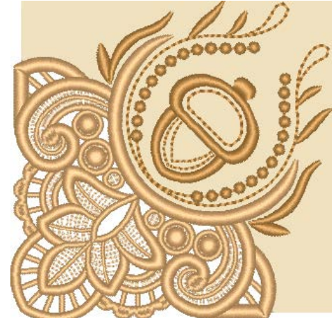
12722-03 Acorn Napkin Corner FSL 3.40 X 3.41 in. 86.36 X 86.61 mm 14,934 St.

Listings below indicate color sample, stitching order and suggested thread color number. Most numbers indicate Isacord thread. Colors beginning with 7 refer to Yenmet Metallic and 9 refer to Isacord Multicolor Variegated.