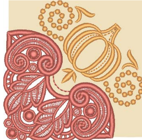
12722-02 Pumpkin Napkin Corner FSL 3.60 X 3.60 in. 91.44 X 91.44 mm 18,757 St.