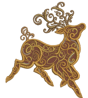
CC03125 Appliqué Filigree Reindeer 3.95 X 4.80 in. 100.33 X 121.92 mm 15,926 St. ❄️

❄️ Design contains a loose fill. ❄️ Some white areas shown are not stitched.