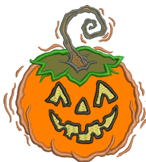
CC03103 Appliqué Jack-o-Lantern 3.71 X 4.00 in. 94.23 X 101.60 mm 11,015 St. ❄️