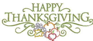
CC03106 Happy Thanksgiving Bounty 2.00 X 4.38 in. 50.80 X 111.25 mm 7,213 St. ❄️