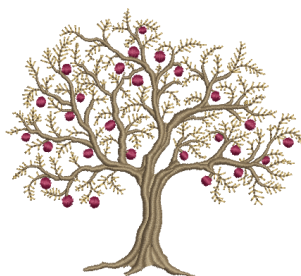
CC03110 Autumn Apple Tree 4.28 X 3.85 in. 108.71 X 97.79 mm 12,240 St. ❄️