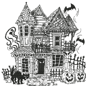
CC03105 Jumbo Halloween Haunted House 6.83 X 6.81 in. 173.48 X 172.97 mm 42,946 St. ❄️ L