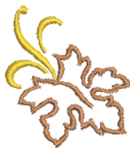
CC03111 Autumn Leaf Swirl 1.31 X 1.48 in. 33.27 X 37.59 mm 1,195 St. ❄️ S