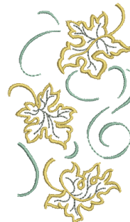
CC03112 Falling Leaf Swirl 2.41 X 4.14 in. 61.21 X 105.16 mm 6,046 St. ❄️