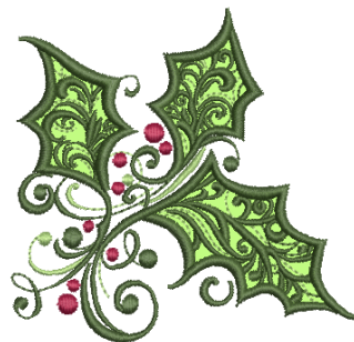
CC03124 Appliqué Holly Filigree 3.56 X 3.38 in. 90.42 X 85.85 mm 10,522 St. ❄️