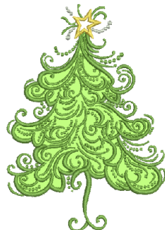
CC03123 Appliqué Filigree Christmas Tree 3.65 X 5.20 in. 92.71 X 132.08 mm 16,218 St. ❄️ L