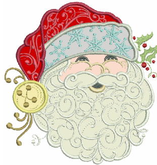
CC03119 Appliqué Santa Claus Portrait 5.39 X 5.69 in. 136.91 X 144.53 mm 25,950 St. ❄️ L