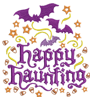
CC03101 Happy Haunting 3.58 X 3.91 in. 90.93 X 99.31 mm 11,320 St. ❄️ L

Note: Some designs in this collection may have been created using unique special stitches and/or techniques. To preserve design integrity when rescaling or rotating designs in your software, always rescale or rotate designs using the handles directly on-screen.