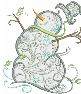
CC03120 Appliqué Filigree Snowman 5.21 X 6.04 in. 132.33 X 153.42 mm 22,944 St. ❄️ L