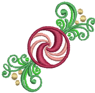
CC03118 Peppermint Swirl 2.26 X 2.18 in. 57.40 X 55.37 mm 4,371 St. ❄️