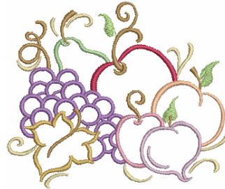
CC03116 Thanksgiving Bounty 3.44 X 2.90 in. 87.38 X 73.66 mm 7,031 St. ❄️