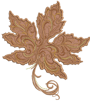
CC03114 Appliqué Autumn Maple Leaf 4.41 X 4.93 in. 112.01 X 125.22 mm 20,447 St. ❄️

Note: Some designs in this collection may have been created using unique special stitches and/or techniques. To preserve design integrity when rescaling or rotating designs in your software, always rescale or rotate designs using the handles directly on-screen.