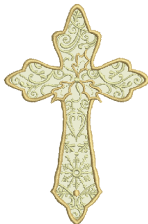
CC03122 Appliqué Christmas Cross 3.98 X 6.11 in. 101.09 X 155.19 mm 13,418 St. L