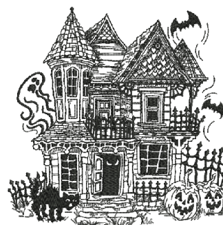
CC03104 Halloween Haunted House 5.46 X 5.45 in. 138.68 X 138.43 mm 34,690 St. ❄️ L