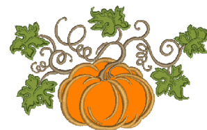
CC03113 Appliqué Pumpkin & Leaves 3.31 X 5.40 in. 84.07 X 137.16 mm 14,510 St. ❄️ L

❄️ Design contains a loose fill. ❄️ Some white areas shown are not stitched.