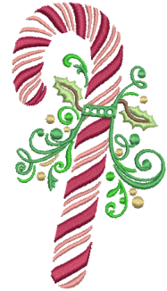
CC03117 Filigree Candy Cane 2.40 X 4.51 in. 60.96 X 114.55 mm 8,428 St. ❄️