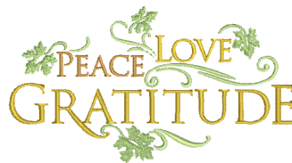
CC03107 Gratitude, Peace & Love 2.57 X 4.72 in. 65.28 X 119.89 mm 8,197 St. ❄️