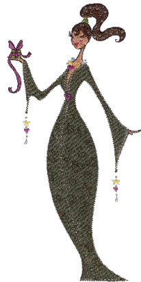
JUMBO Appliqué CC03205 4.91 X 10.34 in. 124.71 X 262.64 mm 14,134 St. ❁ L