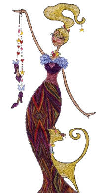
JUMBO Appliqué CC03209 4.59 X 10.45 in. 116.59 X 265.43 mm 19,807 St. ❁ L

❁ Design contains a loose fill. ⚙ Some white areas shown are not stitched.