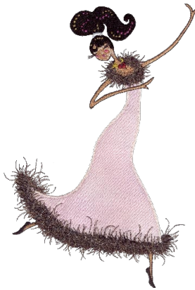
JUMBO Appliqué CC03202 6.71 X 10.39 in. 170.43 X 263.91 mm 21,924 St. ❁ L