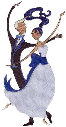
JUMBO Appliqué CC03201 5.85 X 10.59 in. 148.59 X 268.99 mm 27,708 St. ❁ L

Note: Some designs in this collection may have been created using unique special stitches and/or techniques. To preserve design integrity when rescaling or rotating designs in your software, always rescale or rotate designs using the handles directly on-screen.