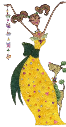
JUMBO Appliqué CC03203 5.39 X 10.26 in. 136.91 X 260.60 mm 26,343 St. ❁ L