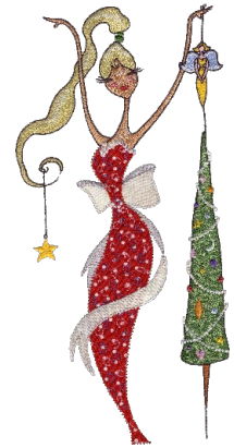
JUMBO Appliqué CC03204 4.82 X 10.21 in. 122.43 X 259.33 mm 27,646 St. ❁ L