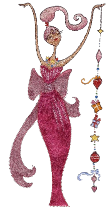
JUMBO Appliqué CC03208 5.13 X 11.37 in. 130.30 X 288.80 mm 21,074 St. ❁ L