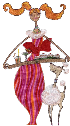
JUMBO Appliqué CC03206 5.36 X 10.10 in. 136.14 X 256.54 mm 36,614 St. ❁ L