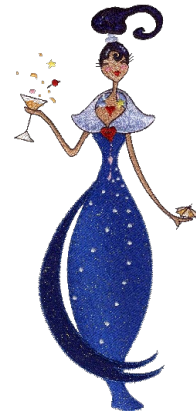
JUMBO Appliqué CC03207 4.76 X 10.66 in. 120.90 X 270.76 mm 14,537 St. ❁ L