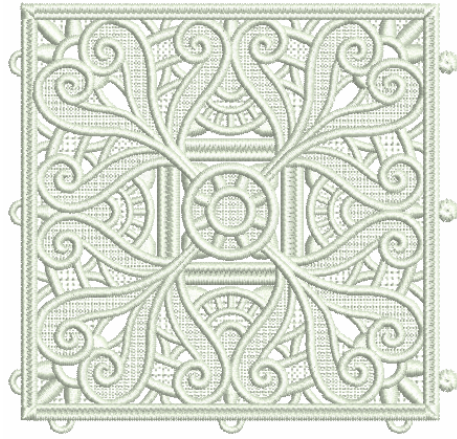
OC03902 FSL Gift Box Side 4.33 X 4.15 in. 109.98 X 105.41 mm 47,230 St. ✿