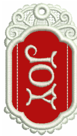
OC03904 FSL Joy Gift Tag with Applique 1.74 X 3.04 in. 44.20 X 77.22 mm 6,625 St. ✿