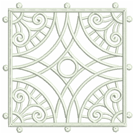
OC03903 FSL Gift Box Bottom with Applique 4.40 X 4.42 in. 111.76 X 112.27 mm 16,796 St. ✿