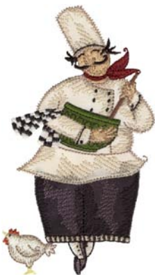
80008-05 Stirring Chef Appliqué 3.15 X 5.58 in. 80.01 X 141.73 mm 15,112 St. ⚙️ L