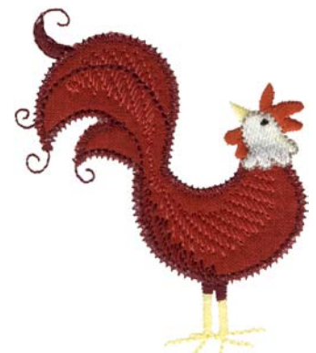
80008-12 Rooster Appliqué 2 2.49 X 3.04 in. 63.25 X 77.22 mm 2,504 St. ⚙️

⚙️ Design contains a loose fill. ⚙️ Some white areas shown are not stitched.