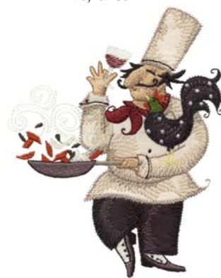
80008-07 Cooking with Wine Chef Appliqué 4.39 X 5.53 in. 111.51 X 140.46 mm 16,212 St. ⚙️ L