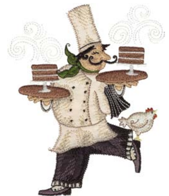
80008-08 Cakes Chef Appliqué 4.45 X 5.51 in. 113.03 X 139.95 mm 20,055 St. ⚙️ L