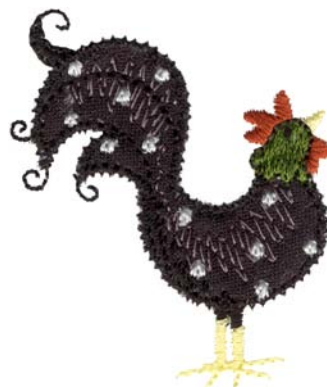
80008-10 Rooster Appliqué 1.68 X 2.02 in. 42.67 X 51.31 mm 1,958 St. ⚙️