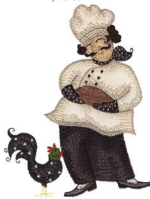
80008-06 Pie Chef Appliqué 4.15 X 5.57 in. 105.41 X 141.48 mm 13,624 St. ⚙️ L