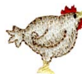
80008-11 Chicken 1.10 X .98 in. 27.94 X 24.89 mm 1,504 St. S