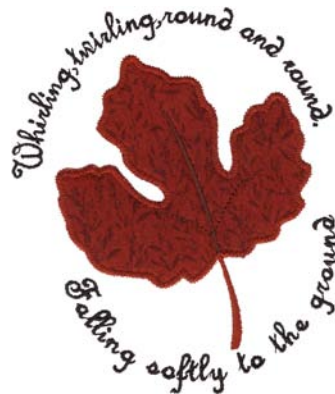
80009-02 Red Leaf Appliqué with Words (Compatible with AccuQuilt GO! Cutter Die #55391) 4.24 X 5.09 in. 107.70 X 129.29 mm 7,892 St. ⚙️ L