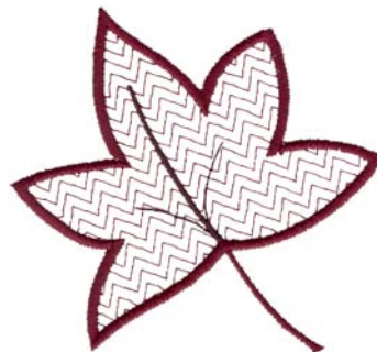
80009-07 Small Maroon Leaf Motif 3.58 X 3.34 in. 65.53 X 84.84 mm 3,771 St. ⚙️