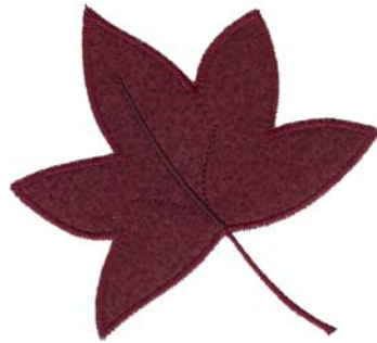
80009-14 Large Maroon Leaf Appliqué (Compatible with AccuQuilt GO! Cutter Die #55389) 4.31 X 3.97 in. 109.47 X 100.84 mm 1,723 St.