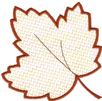
80009-21 Large Orange Leaf Motif 3.83 X 3.85 in. 97.28 X 97.79 mm 4,651 St. ☞