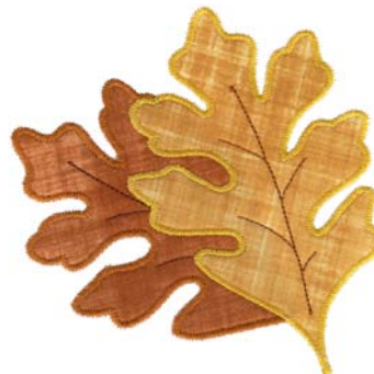
80009-23 Orange & Gold Leaves Appliqué 4.68 X 4.65 in. 118.87 X 118.11 mm 2,999 St.