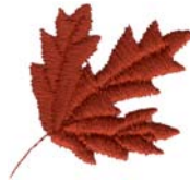
80009-38 Red Leaf 1.41 X 1.36 in. 35.81 X 34.54 mm 2,271 St. S