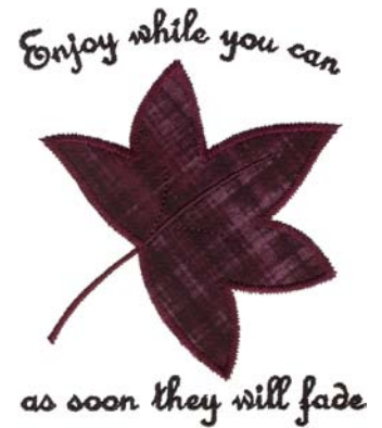
80009-04 Maroon Leaf Appliqué with Words (Compatible with AccuQuilt GO! Cutter Die #55391) 3.64 X 4.45 in. 92.46 X 113.03 mm 5,345 St. ⚙️