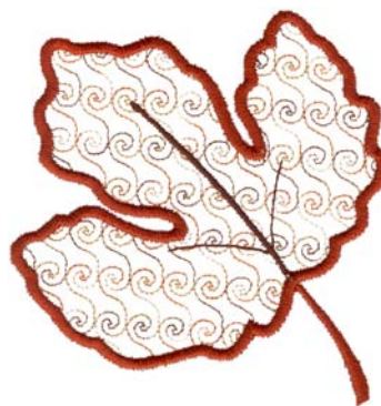
80009-11 Small Red Leaf Motif 3.27 X 3.45 in. 83.06 X 87.63 mm 5,096 St. ⚙️