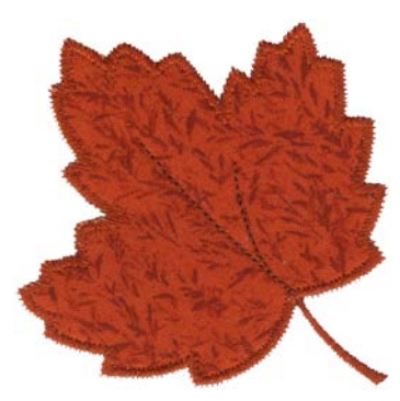
80009-12 Small Orange Leaf Appliqué (Compatible with AccuQuilt GO! Cutter Die #55392) 3.01 X 3.01 in. 76.45 X 76.45 mm 1,093 St.

⚙️ Design contains a loose fill. ⚙️ Some white areas shown are not stitched.