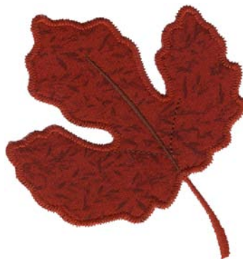
80009-10 Small Red Leaf Appliqué (Compatible with AccuQuilt GO! Cutter Die #55391) 3.37 X 3.90 in. 85.60 X 99.06 mm 1,649 St.