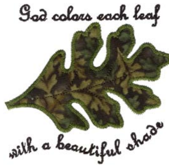
80009-03 Green Leaf Appliqué with Words (Compatible with AccuQuilt GO! Cutter Die #55392) 4.00 X 3.86 in. 101.60 X 98.04 mm 6,133 St. ⚙️