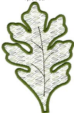
80009-09 Small Green Leaf Motif 2.72 X 4.20 in. 69.09 X 106.68 mm 4,796 St. ⚙️