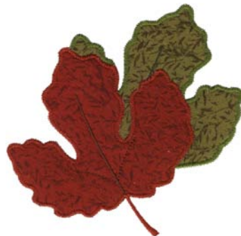
80009-22 Red & Green Leaves Appliqué 4.71 X 4.63 in. 119.63 X 117.60 mm 2,658 St.