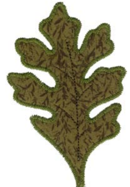
80009-08 Small Green Leaf Appliqué (Compatible with AccuQuilt GO! Cutter Die #55392) 2.64 X 4.12 in. 67.06 X 104.65 mm 1,835 St.