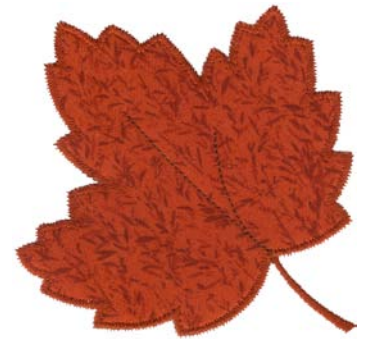
80009-20 Large Orange Leaf Appliqué (Compatible with AccuQuilt GO! Cutter Die #55390) 3.78 X 3.75 in. 96.01 X 95.25 mm 1,371 St.