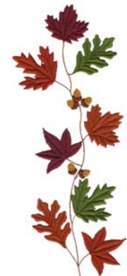
80009-24 Jumbo Leaves & Acorns Border 3.09 X 7.45 in. 78.49 X 189.23 mm 17,461 St. ☞ L

☞ Design contains a loose fill. ☞ Some white areas shown are not stitched.