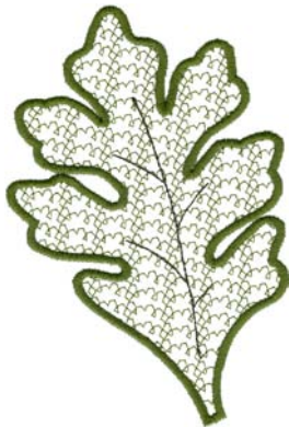
80009-17 Large Green Leaf Motif 3.38 X 5.11 in. 85.85 X 129.79 mm 6,600 St. ☞ L