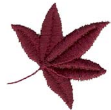
80009-32 Maroon Leaf 1.35 X 1.41 in. 34.29 X 35.81 mm 1,685 St. S