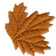
80009-36 Gold Leaf 1.14 X 1.23 in. 28.96 X 31.24 mm 1,911 St. S

Design contains a loose fill. Some white areas shown are not stitched.