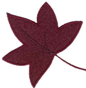
80009-06 Small Maroon Leaf Appliqué (Compatible with AccuQuilt GO! Cutter Die #55391) 3.28 X 3.42 in. 83.31 X 86.87 mm 1,363 St.