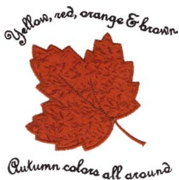
80009-01 Orange Leaf Appliqué with Words (Compatible with AccuQuilt GO! Cutter Die #55392) 4.36 X 4.44 in. 110.74 X 112.78 mm 6,205 St. ⚙️

Note: Some designs in this collection may have been created using unique special stitches and/or techniques. To preserve design integrity when rescaling or rotating designs in your software, always rescale or rotate designs using the handles directly on-screen.