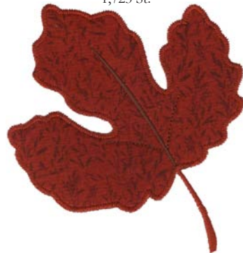
80009-18 Large Red Leaf Appliqué (Compatible with AccuQuilt GO! Cutter Die #55389) 4.07 X 4.35 in. 103.38 X 110.49 mm 2,021 St.