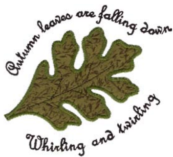
80009-05 Green Leaf Appliqué with Words 2 (Compatible with AccuQuilt GO! Cutter Die #55392) 4.49 X 4.13 in. 114.05 X 104.90 mm 7,014 St. ⚙️