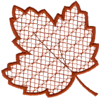
80009-13 Small Orange Leaf Motif 3.09 X 3.11 in. 78.49 X 78.99 mm 4,246 St. ☞

Note: Some designs in this collection may have been created using unique special stitches and/or techniques. To preserve design integrity when rescaling or rotating designs in your software, always rescale or rotate designs using the handles directly on-screen.