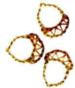
80009-28 Acorns .70 X .89 in. 17.78 X 22.61 mm 333 St. S