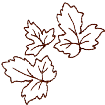
80009-29 Leaves Linework 1.89 X 1.89 in. 48.01 X 48.01 mm 853 St.