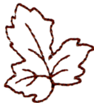
80009-30 Leaf Linework .91 X 1.00 in. 23.11 X 25.40 mm 321 St. S