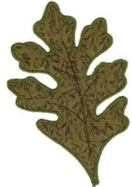
80009-16 Large Green Leaf Appliqué (Compatible with AccuQuilt GO! Cutter Die #55390) 3.30 X 5.03 in. 83.82 X 127.76 mm 1,900 St. L