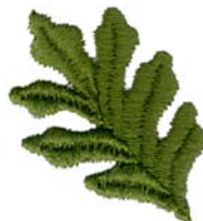
80009-34 Green Leaf 1.19 X 1.33 in. 30.23 X 33.78 mm 2,092 St. S