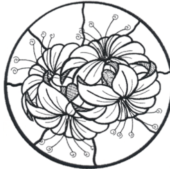
80031-03 Lily Sphere 6.02 X 6.01 in. 152.91 X 152.65 mm 21,919 St. L