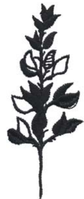
80031-08 Small Leaves 1.25 X 3.23 in. 31.75 X 82.04 mm 3,023 St. S