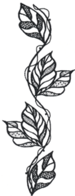
80031-05 Leaves Border 2.80 X 7.57 in. 71.12 X 192.28 mm 14,855 St. L