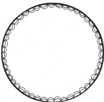
80031-09 Circle Design 1 5.05 X 4.96 in. 128.27 X 125.98 mm 4,164 St. L