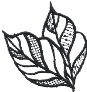
80031-06 Leaves 1.72 X 1.83 in. 43.69 X 46.48 mm 3,833 St.