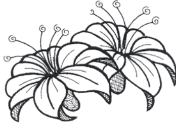
80031-02 Two Lilies 4.83 X 3.46 in. 122.68 X 87.88 mm 10,134 St.