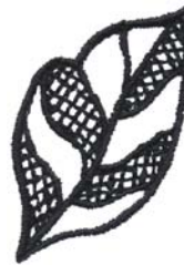
80031-07 Leaf 1.05 X 1.51 in. 26.67 X 38.35 mm 2,451 St. S