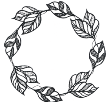
80031-04 Leaves Wreath 5.92 X 5.97 in. 150.37 X 151.64 mm 26,552 St. L