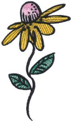
80066-13 Flower 5 2.51 X 4.30 in. 63.75 X 109.22 mm 8,114 St.

Note: Some designs in this collection may have been created using unique special stitches and/or techniques. To preserve design integrity when rescaling or rotating designs in your software, always rescale or rotate designs using the handles directly on-screen.