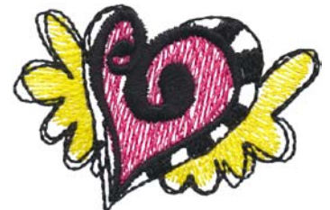
80066-08 Winged Heart 2 2.03 X 1.39 in. 51.56 X 35.31 mm 3,297 St. ⚡⚡ S