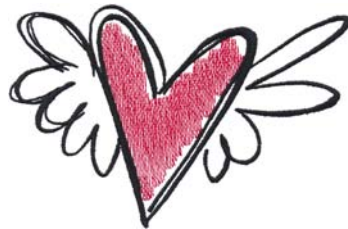
80066-06 Winged Heart 1 5.48 X 3.60 in. 139.19 X 91.44 mm 9,545 St. ⚡⚡ L