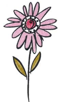
80066-12 Flower 4 3.54 X 6.65 in. 89.92 X 168.91 mm 13,435 St. ⚡⚡ L