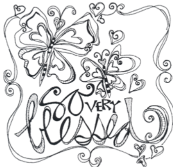
80066-22 SO VERY Blessed 7.72 X 7.54 in. 196.09 X 191.52 mm 26,311 St. L

Design contains a loose fill. Some solid areas shown are not stitched.