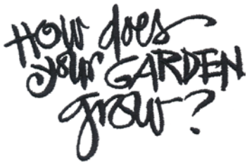
80066-17 How Does Your Garden Grow? 3.70 X 2.43 in. 93.98 X 61.72 mm 6,599 St.