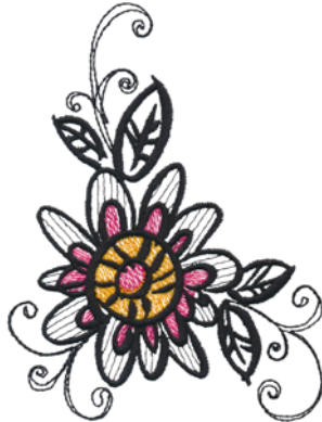
80066-14 Flower 6 3.69 X 4.90 in. 93.73 X 124.46 mm 11,810 St.