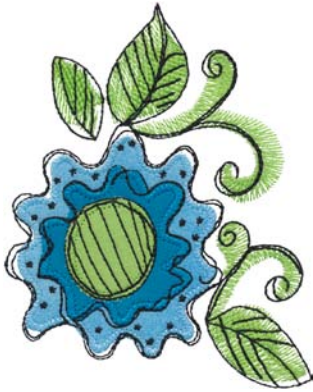
80066-01 Flower 1 Appliqué 3.55 X 4.47 in. 90.17 X 113.54 mm 8,934 St. ⚡⚡

Note: Some designs in this collection may have been created using unique special stitches and/or techniques. To preserve design integrity when rescaling or rotating designs in your software, always rescale or rotate designs using the handles directly on-screen.