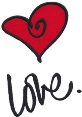
80066-05 Love. Appliqué 3.44 X 4.96 in. 87.38 X 125.98 mm 5,193 St. ⚡