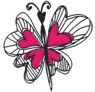
80066-04 Butterfly 1 Appliqué 5.51 X 5.60 in. 139.95 X 142.24 mm 19,556 St. ⚡⚡ L