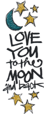
80066-15 Love You to the Moon and Back 2.62 X 6.86 in. 66.55 X 174.24 mm 10,887 St. L