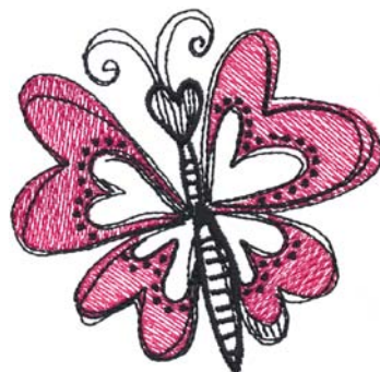
80066-10 Butterfly 2 3.13 X 3.13 in. 79.50 X 79.50 mm 8,354 St. ⚡⚡