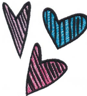
80066-07 Hearts 3.00 X 3.29 in. 76.20 X 83.57 mm 8,041 St. ⚡