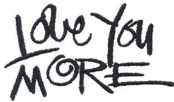
80066-18 Love You More 3.04 X 1.70 in. 77.22 X 43.18 mm 3,642 St.