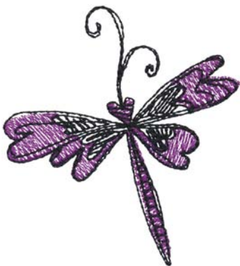
80066-09 Dragonfly 2.63 X 2.90 in. 66.80 X 73.66 mm 3,987 St. ⚡⚡