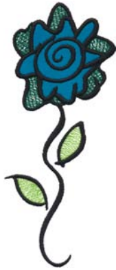
80066-02 Flower 2 Appliqué 2.52 X 5.98 in. 64.01 X 151.89 mm 9,247 St. ⚡ L