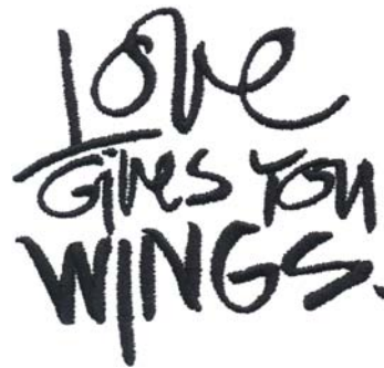
80066-19 Love Gives You Wings. 2.80 X 2.66 in. 71.12 X 67.56 mm 5,007 St.