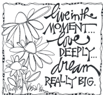
80066-21 Live in the MOMENT... Love DEEPLY... Dream REALLY BIG. Jumbo 8.00 X 7.33 in. 203.20 X 186.18 mm 26,535 St. L