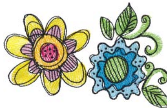
80066-11 Flowers 4.80 X 3.02 in. 121.92 X 76.71 mm 12,610 St. ⚡⚡