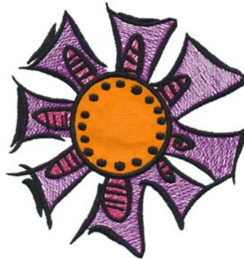
80066-03 Flower 3 Appliqué 4.29 X 4.53 in. 108.97 X 115.06 mm 18,247 St. ⚡⚡