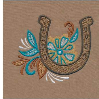
80136-03 Western Beauty Horseshoe 4.02 X 3.38 in. 102.11 X 85.85 mm 14,025 St.