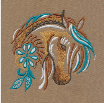
80136-01 Western Beauty Horse 1 3.99 X 3.83 in. 101.35 X 97.28 mm 16,847 St.

Note: Some designs in this collection may have been created using unique special stitches and/or techniques. To preserve design integrity when rescaling or rotating designs in your software, always rescale or rotate designs using the handles directly on-screen.