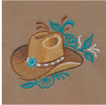
80136-02 Western Beauty Cowboy Hat 4.40 X 3.66 in. 111.76 X 92.96 mm 12,923 St.