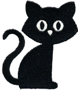
80158-02 Cat Silhouette 1 2.68 X 3.21 in. 68.07 X 81.53 mm 7,215 St.