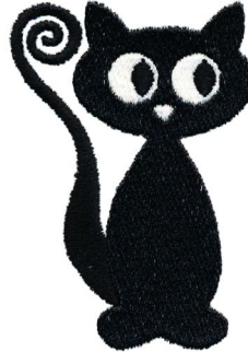
80158-03 Cat Silhouette 2 2.19 X 3.21 in. 55.63 X 81.53 mm 6,716 St.