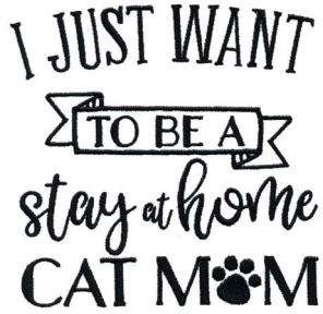
80158-01 Cat Mom 4.77 X 4.75 in. 121.16 X 120.65 mm 14,215 St.

Note: Some designs in this collection may have been created using unique special stitches and/or techniques. To preserve design integrity when rescaling or rotating designs in your software, always rescale or rotate designs using the handles directly on-screen.