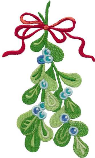
80169-01 Mistletoe 3.33 X 5.66 in. 84.58 X 143.76 mm 18,702 St.

Note: Some designs in this collection may have been created using unique special stitches and/or techniques. To preserve design integrity when rescaling or rotating designs in your software, always rescale or rotate designs using the handles directly on-screen.