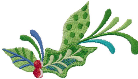
80169-02 Holly 1 4.35 X 2.48 in. 110.49 X 62.99 mm 9,068 St.