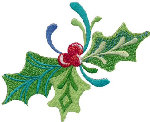
80169-03 Holly 2 4.20 X 3.50 in. 106.68 X 88.90 mm 11,649 St.