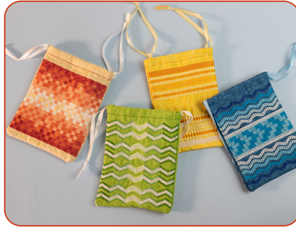
Completed Size: 5" x 6.75"